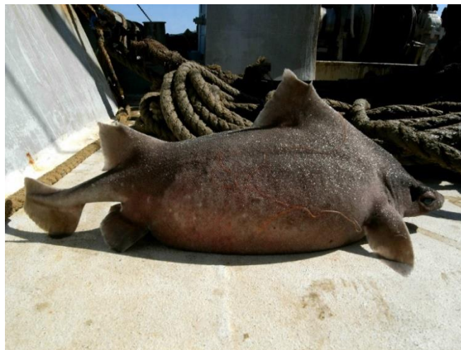
Figure 1. Gravid female angular rough shark, Oxynotus centrina , captured from Antalya Bay (specimen no 22 in Table 1)

Length-weight data of Oxynotus centrina (n=34; Figure 1), that were examined in the present study, were obtained from the following sources: (1) unpublished morphometric measurements of the O. centrina individuals (n=17), which were recorded during the 1960 expedition of the former Meat and Fish Institution of the Republic of Turkey and donated to first author (HK) for analysis by Turkish Marine Research Foundation (TÜDAV); (2) length-weight measurements of the Mediterranean specimens of O. centrina (n=16), which were published in relevant references (Megalofonou & Damalas, 2004; Dragičević et al., 2009; İşmen et al., 2009; Barría et al., 2015; Baştusta et al., 2015; Kousteni & Megalofonou, 2016; Yiğın et al., 2016; Koehler, 2018) and (3) unpublished length-weight data of a gravid female (n=1), which is kept in the archives of second author (EÖÖ). The geographical distribution of the examined individuals of O. centrina throughout the Mediterranean Sea is shown in Figure 2.