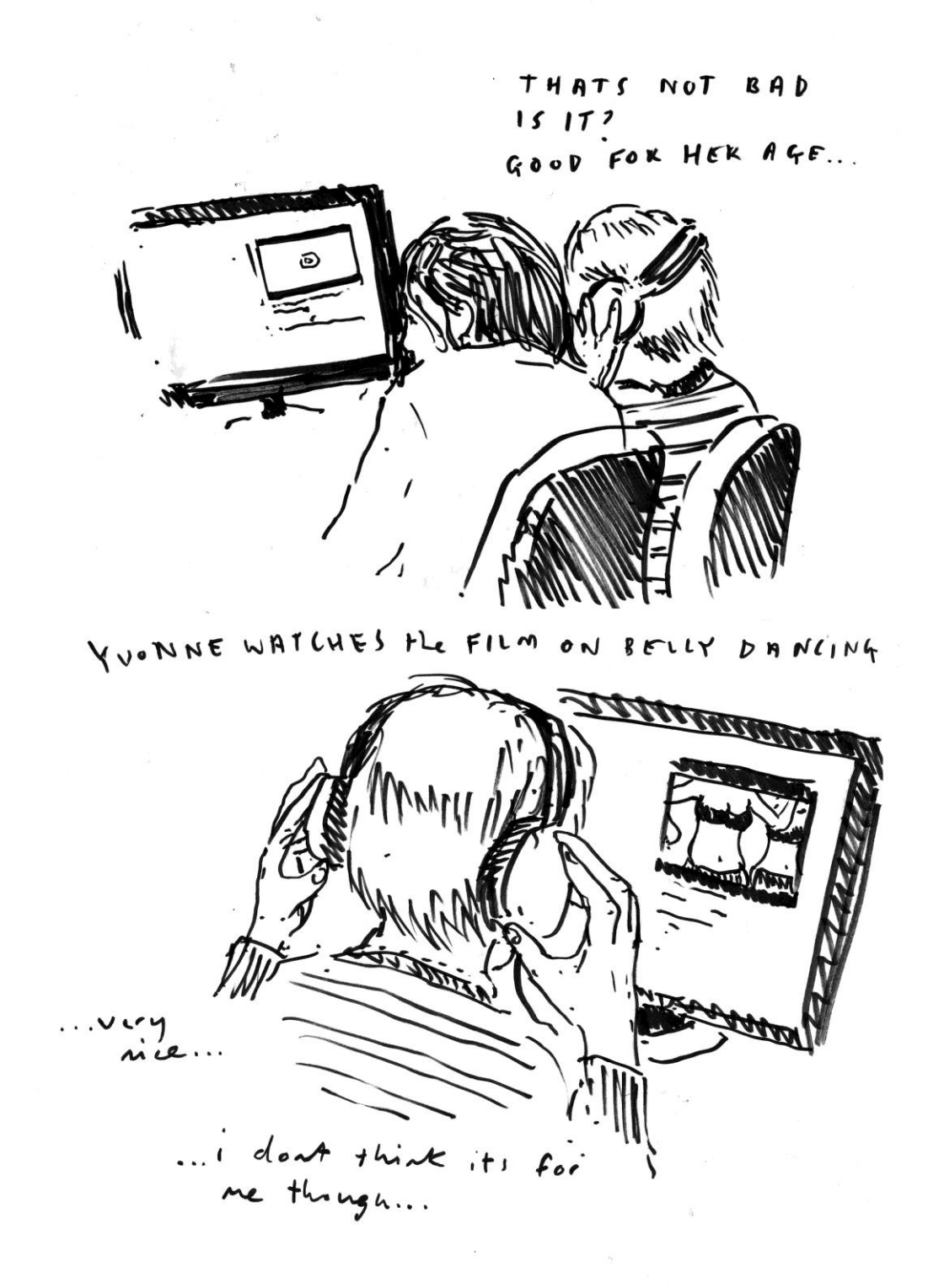
Figure 9. Sketch of a "pop-up," when residents gather around a computer to watch the ULK videos, 2013, Joff Winterhart, artist.