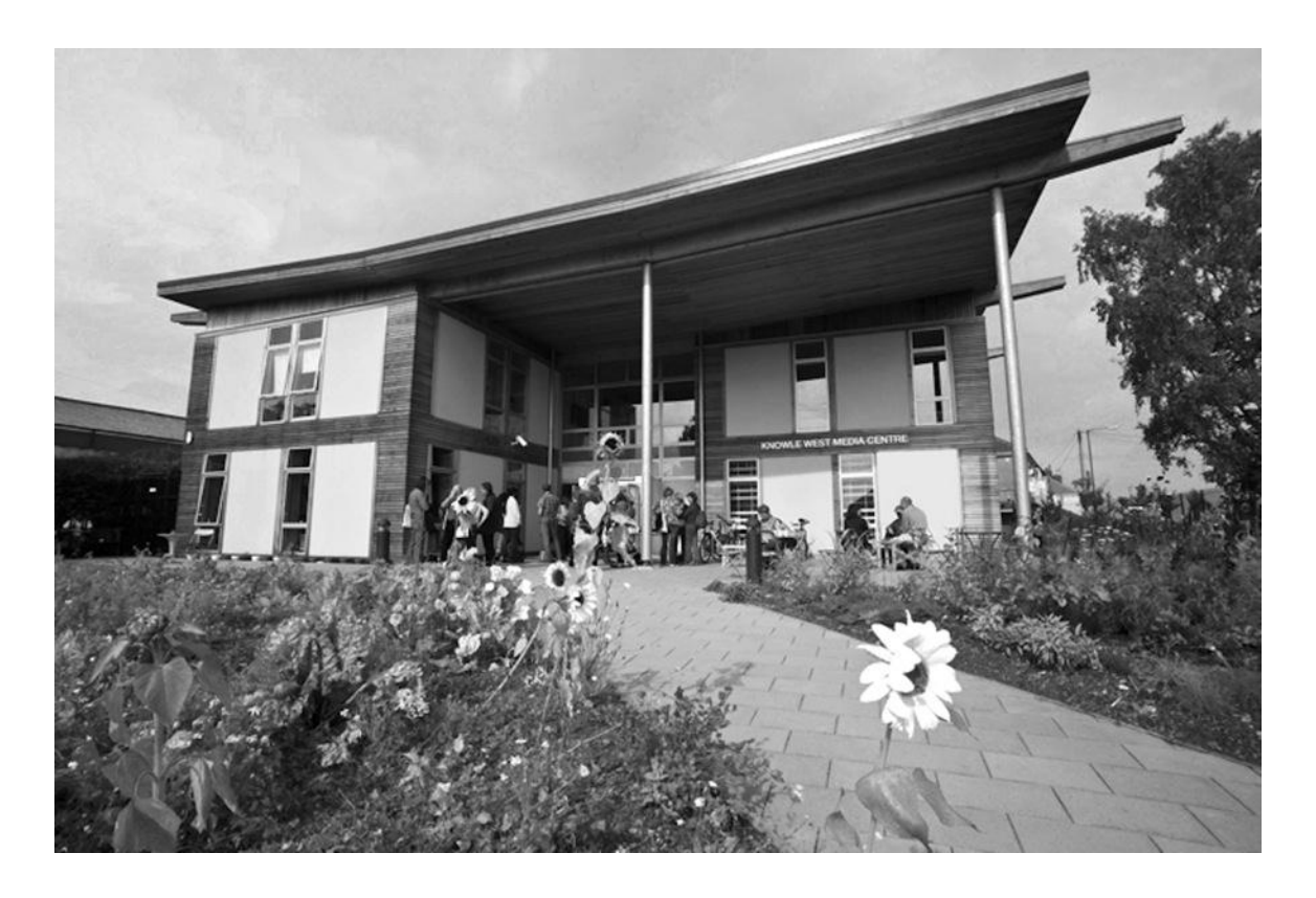
Figure 1. Knowle West Media Centre, Bristol, UK. The straw bale building has a computer lab, auditorium/gallery, sound studio, and office space for rent, among other amenities.