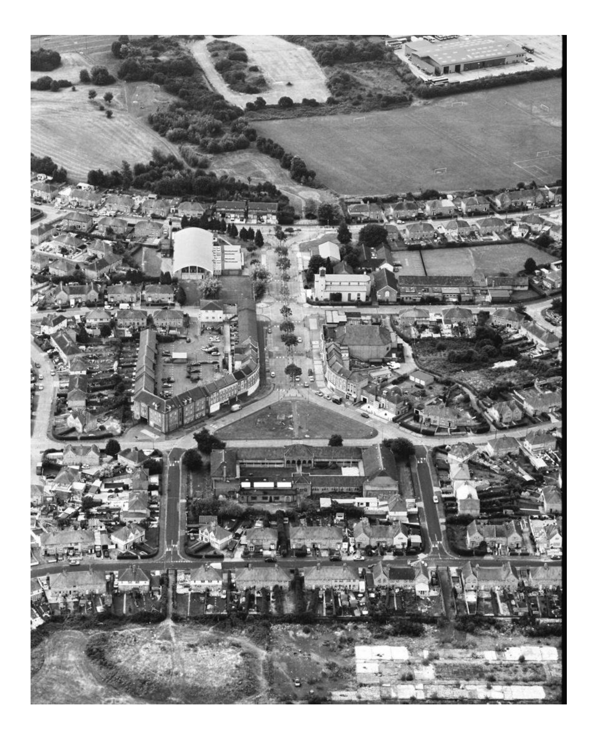
Figure 2. Aerial view of Knowle West showing the triangular open space in front of the community center, where the ULK Lunch on Green was launched in June 2010. Shops and flats face the green on the other sides.