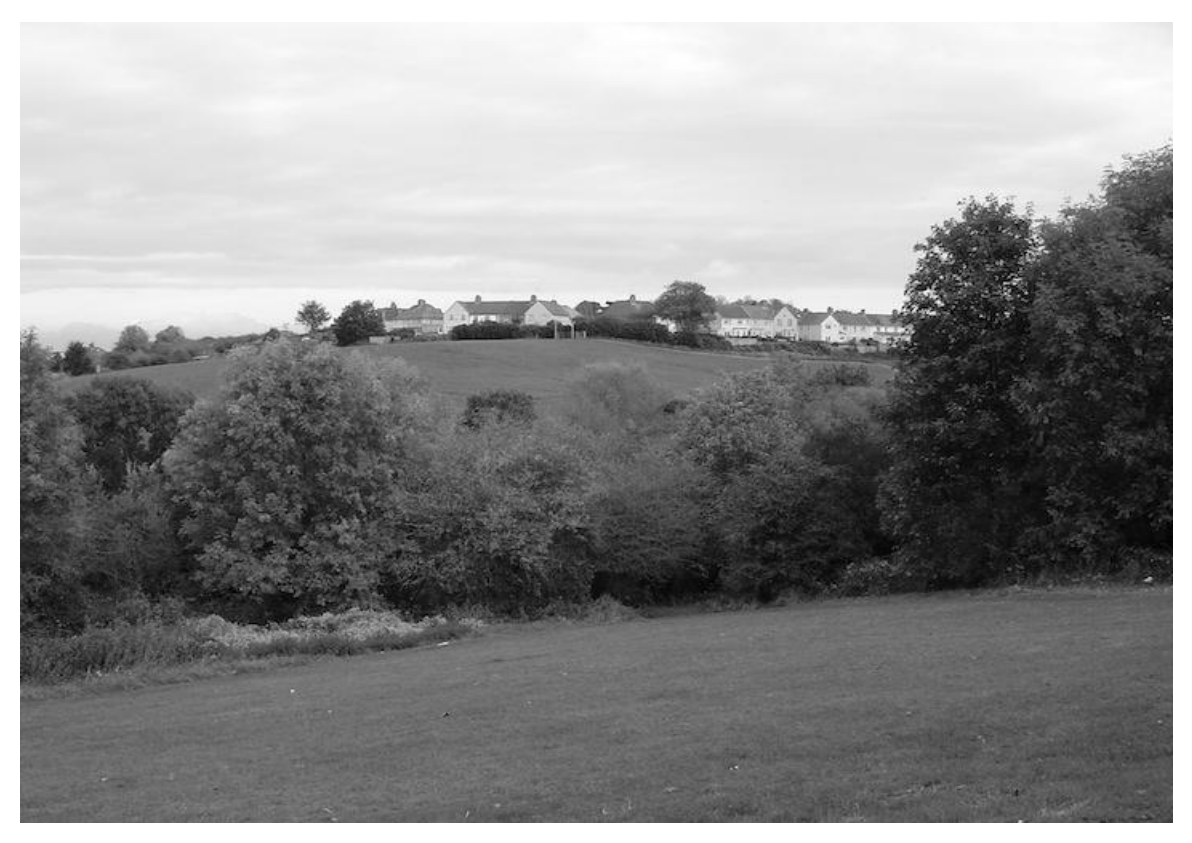
Figure 3. Knowle West, Bristol, viewed from the surrounding green space.