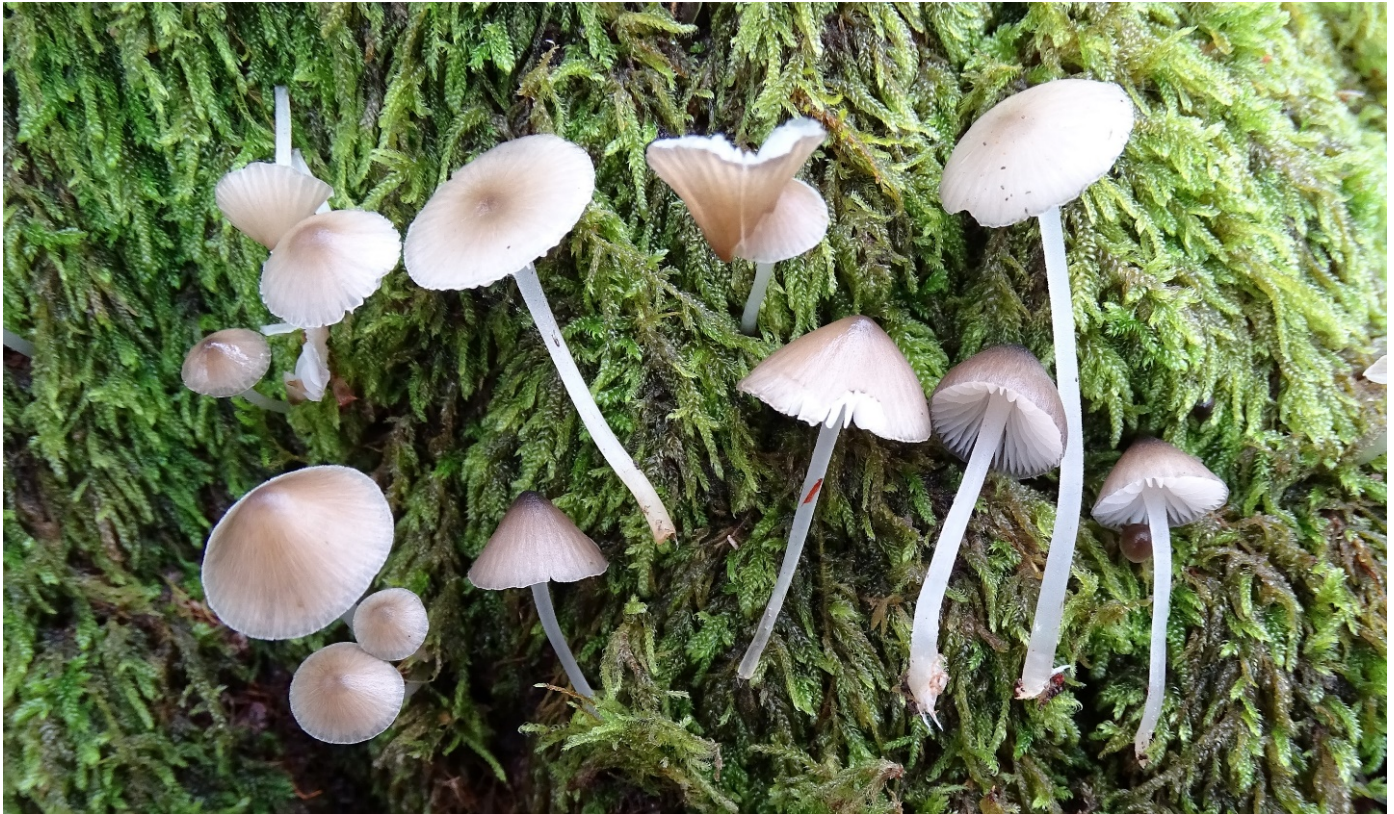
Figure 1. Basidiocarps of Pseudohydropus floccipes .

Macroscopic and microscopic features: Pileus 7-23 mm in diam., conical to campanulate when young, convex, broadly convex to almost applanate at maturity some with an obtuse umbo, margin acute, surface smooth, brown to grey-brown when young, pale grey-brown to brown-beige when mature, mostly lighter towards the margin and darker at the center or towards the center, some with slightly hygrophanous appearance. Flesh thin, concolorous with the surface. Lamellae white, distant, adnexed. Taste mild, odor indistinct. Stipe (18-) 20-55(-60) × 0.9-2 mm, cylindrical, equal or slightly tapering towards the apex or base, surface smooth, whitish to pale greyish, context concolorous to somewhat hyaline, some whitish hairy at the base.