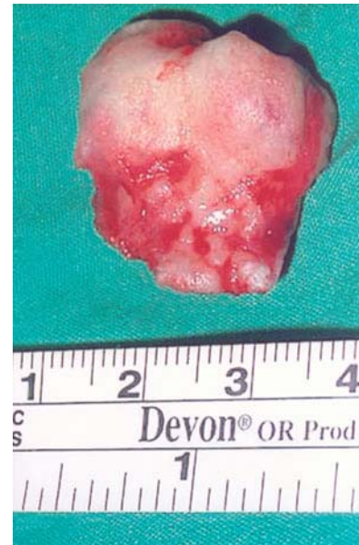
Fig. 2: Macroscopic appearance of the frontoethmoid osteoma after resection (2,5x2x2 cm)

The operation was performed under general anesthesia using endotracheal intubation. The patient is placed in the supine position with the head slightly elevated and turned towards the surgeon. The face was disinfected properly. Pledgets soaked with 1:1000 epinephrine were applied to the middle meatal area. Ten minutes after application, the pledgets were removed. The middle turbinate was subluxed medially to allow adequate visualization of the middle meatus. After uncinectomy, ethmoid bulla was opened and the whitish osteoma appeared. The osteoma was completely mobilized using a freer elevator. The middle turbinate was partially resected and then the mass was removed with a forceps. A gross specimen is shown in Fig 2. After control of minor hemorrhage, the area was inspected and there was no CSF leakage. Merocel packing was applied.