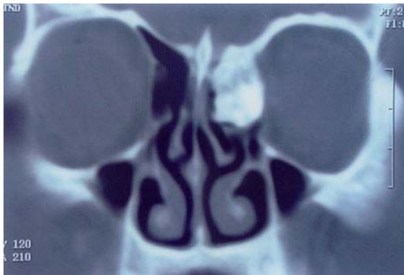
Fig. 1: Preoperatif coronal computed tomography scan showing an osseous mass in the left frontoethmoid region

A 28-year-old female patient presented with a 1-year history of left-sided facial and frontal pain. There was no history of trauma, nasal surgery, or major paranasal sinus infection. Nasal endoscopy revealed nothing abnormal. The remainder of the head and neck examination was unremarkable. Subsequent computed tomography (CT) scan of the paranasal sinuses revealed an extremely dense lesion located in the left frontoethmoid region (Fig.1). Both anterior and posterior ethmoid cells were affected by the lesion. There was no significant secondary sinusitis. The lesion extended to orbita and skull base without invading them. These findings strongly suggested an osteoma. The patient consented to endoscopic removal of the mass. The possibility of intraoperative need for an open approach was also discussed with the patient.