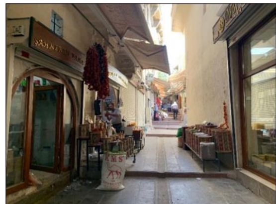
Figure 4. Stores before and after the restoration in spice bazaar