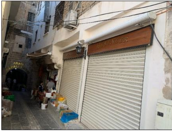
Figure 5. Shutters specific to the modern passages on the facades of the bazaar, air conditioners placed on the facades, and sun shades placed in order to protect the spices from the sun