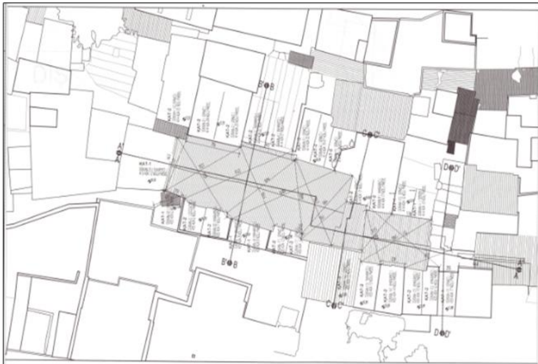
Figure 2. The layout plan of the bazaar