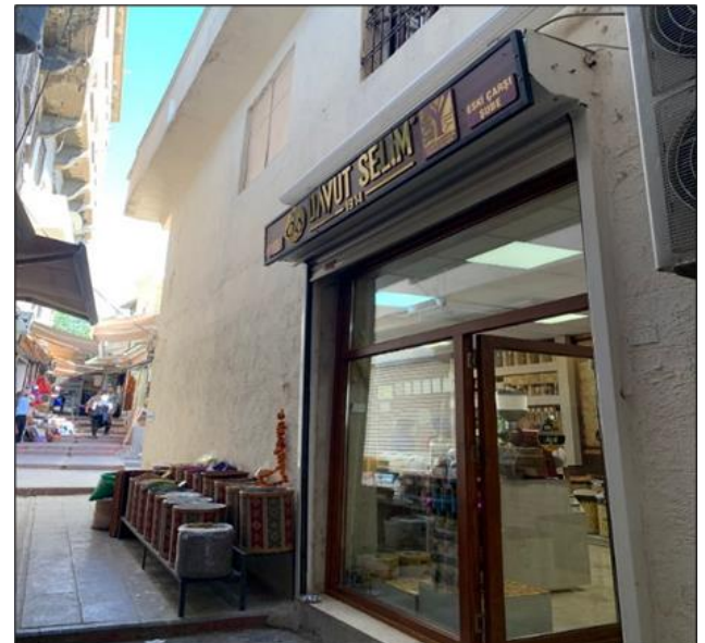
Figure 6. Placing shop windows and spotlights to exhibit the spices

In summary, it is seen that even a few basic changes to be made on the buildings and environments of the bazaar in order to improve the performance of the bazaars and modernize them, change the characteristic and personality of the bazaar radically; this has made it a