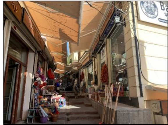
copy of its equivalents in other geographies and thus damaged the place concept and sense of belonging of a bazaar.