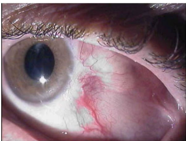
Fig. 2: Thinned scleral area six months after repairing with graft. Conjunctiva is epithelised over the grafted area.