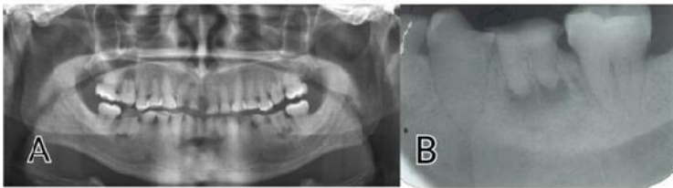
Figure 5 A: Panoramic radiograph shows generalised bulbous crowns with prominent cervical constriction, altered morphology of pulpal space, short roots, loss of enamel cap in anterior teeth, periapical radiolucency in maxillary right first molar, central incisor and mandibular right and left permanent first molar. Figure 5 B: IOPA of mandibular left permanent first molar shows obliteration of pulpal space, periapical radiolucency indicative of periapical infection.