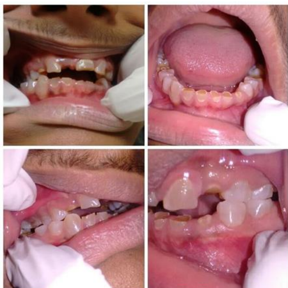
Figure 2: Clinical images of Case 1 showing discoloration and loss of vertical dimension, root stumps of mandibular left and right permanent first molar. Retained deciduous root stumps with respect to maxillary right and left canine, mandibular left canine.