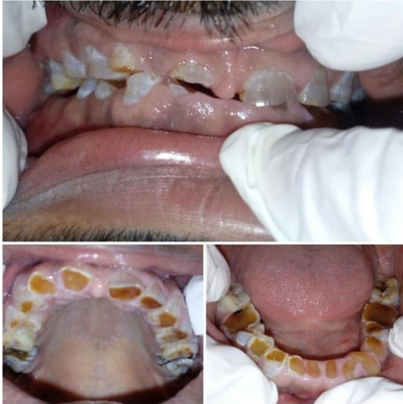
Figure 4. Clinical images of Case 2 shows generalized yellowish brown discoloration and severe attrition.