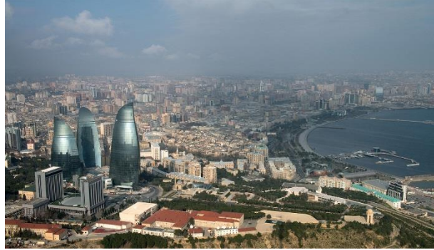
Figure 2: Baku flame towers – Baku, Azerbaijan

townscape point of view inspire the opportunity of making a tall building that will act as a landmark and enhance the idea of legibility (LBHF, 2015).