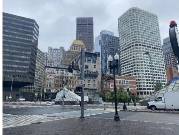
Figure 6: Boston city, USA

Public areas next to a tall building going to be enlarged due the nature of this building that's why another issue to consider in a tall structure is the diversity of the functions with the connectivity between the ground level of this tall element and people, by creating a human scaled masses, which encourage human activities. In order not to face a situation of depopulation, and emptiness on that urban spot (figure 6).