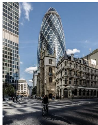
Figure 7: 30St Mary Axe

Tall buildings have a direct effect on people's emotions due to their size so considering the intangible aspects while designing a tall buildings is a handy way of promoting the place making and improving the quality of community's life. Taking into account the cultural heritage of the place and how this building going to form a new identity or enhance the existing one is also important to promote the feeling of belonging of the citizens on that area.