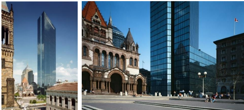
Figure 5: The John Hancock tower Boston, USA

Thinking about the harmony of the tall structures, and their role of being in the every day's story of the citizen, help fitting a dominant element that promote the community involvement in the design of these tall buildings. Support considering it as a landmark that highlight the urban order of that area and make the people able to communicate with it (Jacobs, 1961). A landmark that will prevent what Lynch describe it as a 'disaster' and that when getting lost in a city (Lynch, 1960). The buildings arrangement within a street direct our sight into an important point which is the best place to locate a tall building, this location with that arrangement going to give this structure more than an architectural value (Czyńska, 2017). Studying and understanding the architectural mass of a tall building with its perception from close view and a distant, relating it with its physical surrounding will contribute making an imageable city and participate creating the mental map of that place.