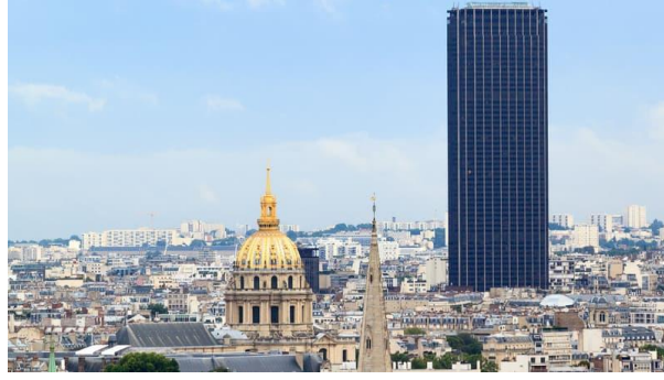
Figure 3: Tour de Montparnasse – Paris, France

It is important when looking at a silhouette of a city to have a harmonic relation between its elements and their sizes. In addition, to notice the clear composition that will lead into a strong urban structure. And not to see a distortion between new and old tall buildings as a meaning of considering the identity and respecting the cultural heritage of the city (Czyńska, 2015) which at the end will help creating a futuristic city that has a homogeneous silhouette which appreciate the civilization of the area and its community (figure 3).