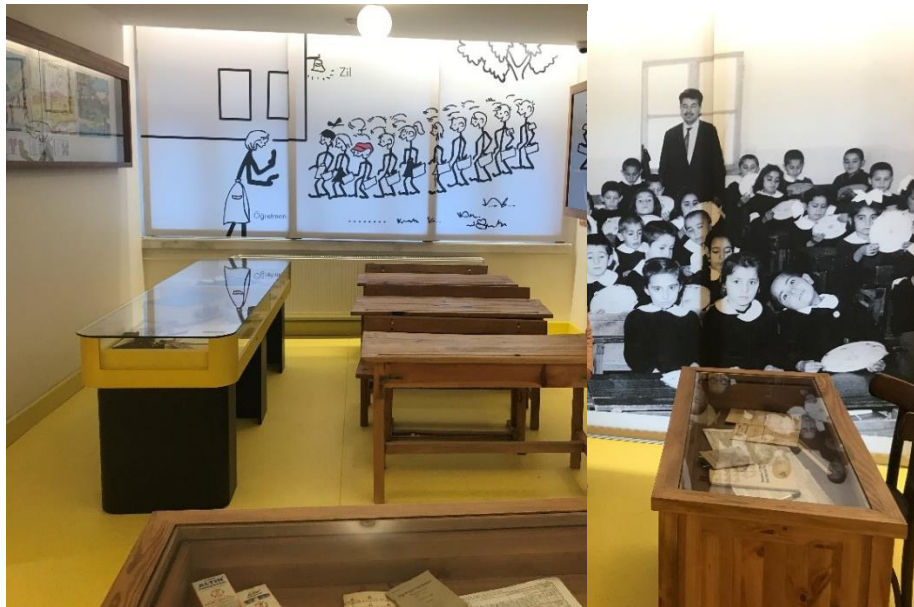
Image 5.1.-A Class Section, Author's Archive, 2022.