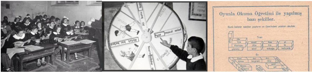
Image 4. Primary School Classroom View, Educational Games