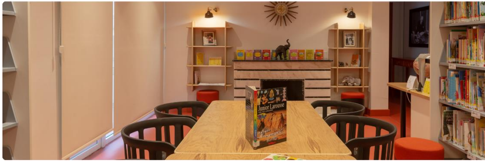
Image 3. Library Department

When we look at the sections of the museum building, there is a café, a recreation area and a library. In the library, there is an area to reflect the cultures of the 60s, 70s, and 80s, as well as some educational materials.