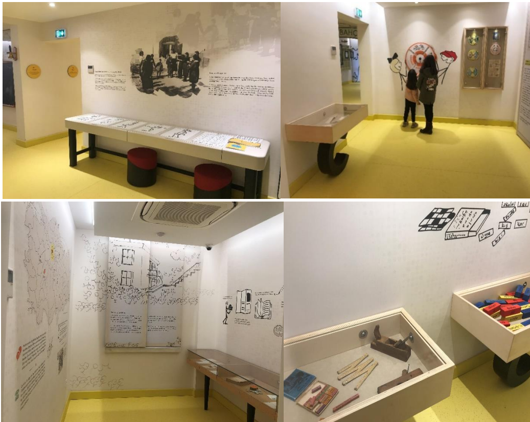
Image 7. Exhibit Elements