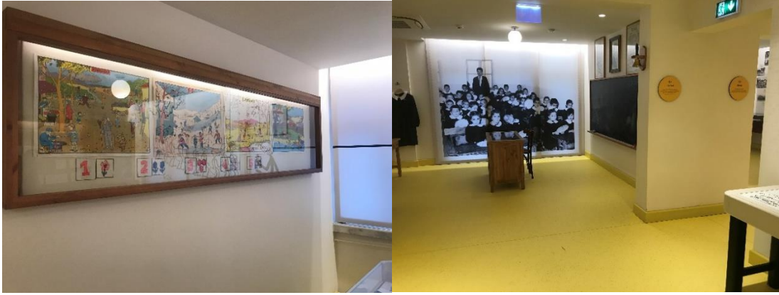
Image 6. Interior View

The classroom environment portrayed in the museum represents the classroom environment and the "desk", which has been used in public schools in Turkey since the beginning of the Republican period and has seating for 3 people. The classroom environment was reflected in the museum with the teacher's desk, chalkboard, seasons table, reading slips. In these classroom environments, students are placed in a seating element called a desk with 2 or 3 students sitting together. The long table in front of them is also included in this desk concept. Under this table, which is used for typing, there is a section for them to put their books.