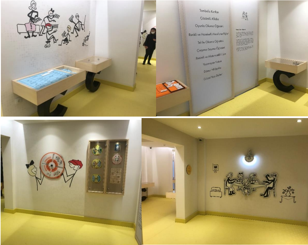
Image 8. Cin Ali museum Interior View

While some educational materials in the museum are covered with glass, it is seen that materials such as wooden blocks, which are planned to be played and learned by touching, are exhibited in the open. On the wall surfaces, images from village institutes, illustrations, scenes from the book are applied in black on a white background. In this context, it is seen that typography and illustration are dominant throughout the space. The game, which uses bingo to develop vocabulary, can be played interactively.