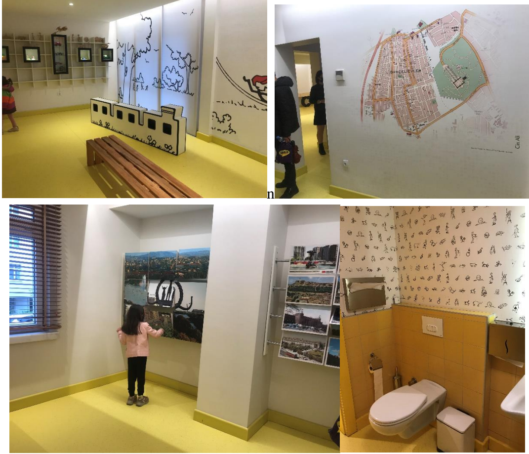
Image 10. Another of The Interactive Games is The Puzzle on The Wall Formed by Moving The Visuals.

In the toilets in the café section, the drawings of the cartoon character were continued on the wall and the yellow colour was used in the yellow tiles throughout the space.