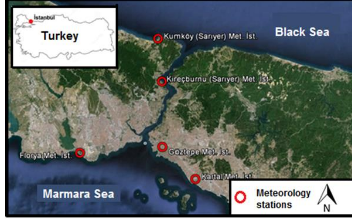
Figure 1. The General view of the surveyed meteorology stations Şekil 1. Araştırmada değerlendirilen meteoroloji istasyonlarının genel görünümü

of precipitation up to today has been made in meteorology stations with devices called pluviograph and rain gauge. While rain gauges measure precipitation directly, pluviographs save the information on an embedded diagram. With the developments in technology, pluviographs are replaced by rain gauges, and this situation will lead to a certain amount, however tiny, of difference based on the differences in measurement.