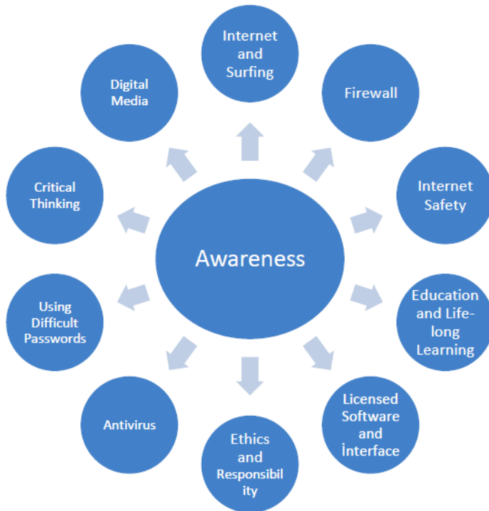
Figure 3. Categories of the Awareness Subscale

For internet browsing and security internet, T1, T2, T4, and T7 stated that they did not receive any training or that the education they received was not useful, T5 mentioned that they received education in undergraduate education, and T3 and T6 explained that they attended an in-service seminar. It was determined that all of the participants, whether they had received training or not, had developed themselves and were aware of the virtual environment for internet surfing and safe internet. The descriptive analysis of the participants' opinions in the Awareness subscale and the analysis results of the data obtained from the quantitative data showed consistency.