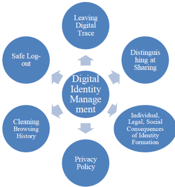
Figure 5. Categories on the Digital Identity Management Subscale

The primary school teachers who participated in the study were asked what it means to leave a digital trace. T1 explained that they were site addresses, user names, and passwords used after using the computer, T2 explained that they left documents, photos, or videos in digital tools, and T5 explained that all kinds of information they shared while using the internet and every site they entered were digital fingerprints. T7, unlike the other teachers, defined the concept of a digital trace as “any kind of trace we leave intentionally or unintentionally, by touching or typing”. T3 defined it as “seeing what the person using that device has done after using a digital device that does not belong to them”. The common idea of the study group in the definition is all kinds of traces they leave behind after using the internet on a digital device, and this definition is correct. When the primary school teachers were asked what they did after using a digital device that did not belong to them, all of the teachers said that they used the safe logout option. It can be stated that the sensitivity of the primary school teachers participating in the study on security measures and digital traces was parallel with the results of the quantitative study.