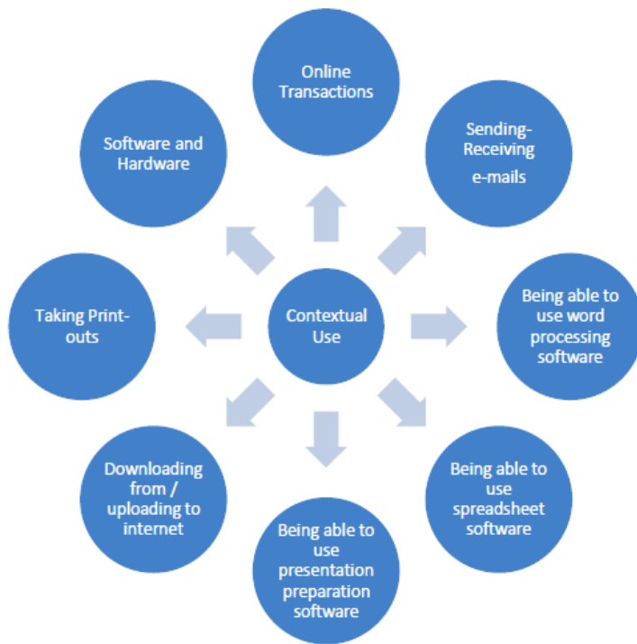
Figure 2. Categories of the Contextual Use Subscale Opinions

T2 stated that he could carry word processing, spreadsheet, and presentation preparation software with a USB memory stick, send them as e-mail attachments, and open them as attachments. The primary school teachers who participated in the research stated that they could perform almost all of the online transactions and that they used their mobile phones for these operations. They stated that they were able to receive printouts from the printer as a result of these processes. All of the primary school teachers who participated in the research said that they had the skills to use word processing software, spreadsheet software, and presentation preparation software. The quantitative results of the study and the answers given by the primary school teachers to this subscale were parallel to each other.