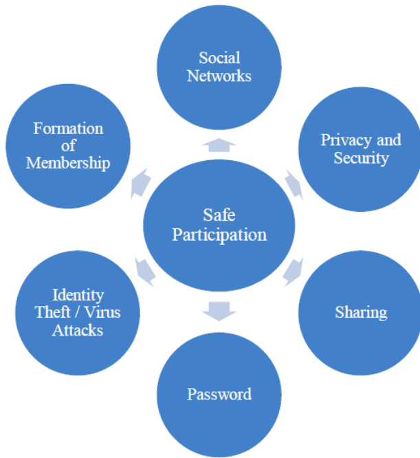
Figure 4. Categories of the Safe Participation Subscale

All of the teachers participating in the study have memberships in social networks, and the teachers, except for T1, stated that they use them actively. T1, T2, and T6 stated that they did not upload documents, photos, or videos unless they had to because they did not trust social networks, while T3, T4, T5, and T7 said that they uploaded and downloaded them. T1 said that he is cautious about uploading because he has read several negative news stories about photos uploaded without permission in news bulletins and internet news sites. All of the primary school teachers have stated that even the people closest to them cannot guess the passwords they have created for these networks and virtual environments. When the aims and scope of the subscale and the answers of the participants were compared, it was evaluated that the participants were Very Adequate, which is similar to the results of the quantitative data.