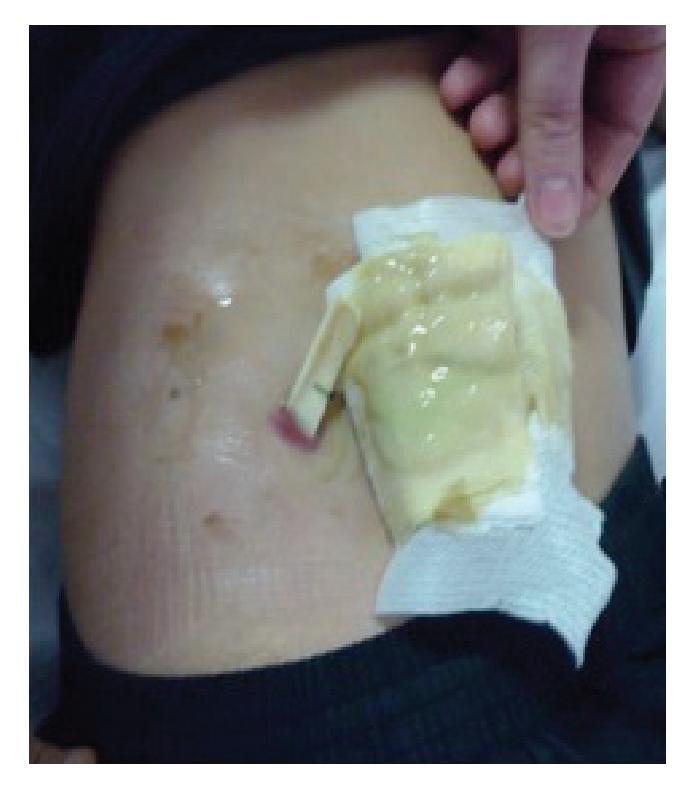
Figure 1. Purulent material draining through the percutaneous catheter on the right iliac fossa.

evaluation of the patient was as follows: Hemoglobin: 10.1 g/dL, white blood cell count: 7.3x10<sup>9</sup>/L, erythrocyte sedimentation rate: 76 mm/h, C reactive protein: 52 mg/dL (0-5), IgG: 1594 mg/dL. Biochemical tests were all normal. Anti-HIV and Brucella Wright agglutination were negative. Tuberculin skin test was measured as 15 mm. An interferongamma related assay test was found to be positive. Chest X ray was normal. Magnetic resonance imaging (MRI) revealed osteomyelitis and spondylodisciitis on L2, L3 and S1 vertebra and right sided psoas abscess. Furthermore, osteomyelitis and an abscess of 15x17 mm on proximal tibia were visible on MRI of the right knee. A four drug regimen of antituberculous treatment (isoniazid, rifampicin, ethambutol, pyrazinamide) was commenced. Subsequently, specific culture of purulent material draining through the catheter on the right lower abdomen yielded Mycobacterium tuberculosis complex. Antimicrobial susceptibility testing was performed for the following four antituberculous drugs and the isolate was found to be susceptible to all of them Isoniasid (2,5µg/ml), Rifampicin (0,1 µg/ml), Streptomycin (2 \mu g/ml) , Ethambutol (2.5 \mu g/ml) . After the first month of anti-tuberculous treatment, complaints of the patient were resolved completely with increasing appetite and weight gain of 2 kilograms.