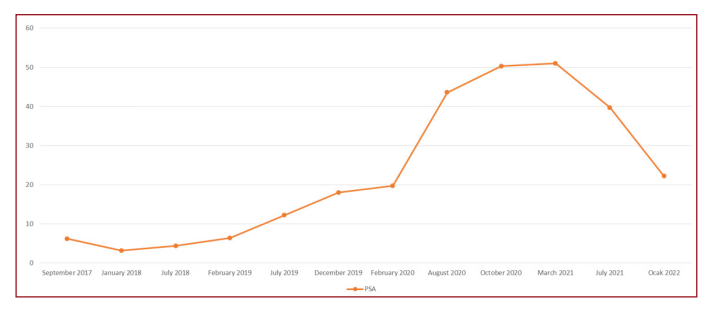
Graphic 1. Prediction of PSA with enzalutamide treatment

Creatinine progression, anuria, metabolic acidosis developed before the 16th cycle (July 2017), he was taken to the routine HD program continued 2 days a week. Serum PSA elevated to 6.2 ng/ml and progression was observed in bone scintigraphy in September 2017. Enzalutamide (160 mg/day) was started as a step treatment. PSA level decreased to 3.9 ng/ml in a month, clinic-radiologically findings were stable for 2 years ( Graphic 1 ).