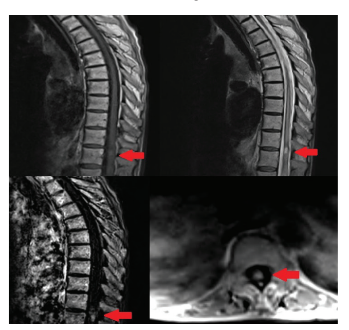
Figure 1. Sagittal T1 and T2-w, post contrast sagittal and axial thoracic spine MRI images demonstrated a contrast enhanced intramedullary spinal cord lesion with a diameter of 20x7 mm, at the 11th-12th thoracic spine level.