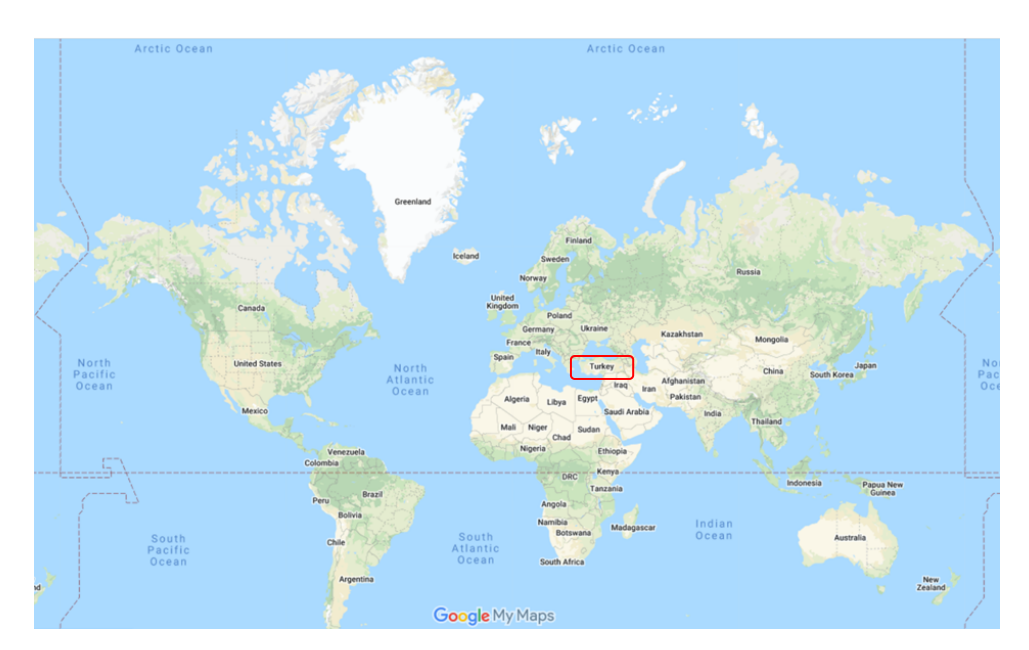
Fig. 1. Türkiye's Location in the World