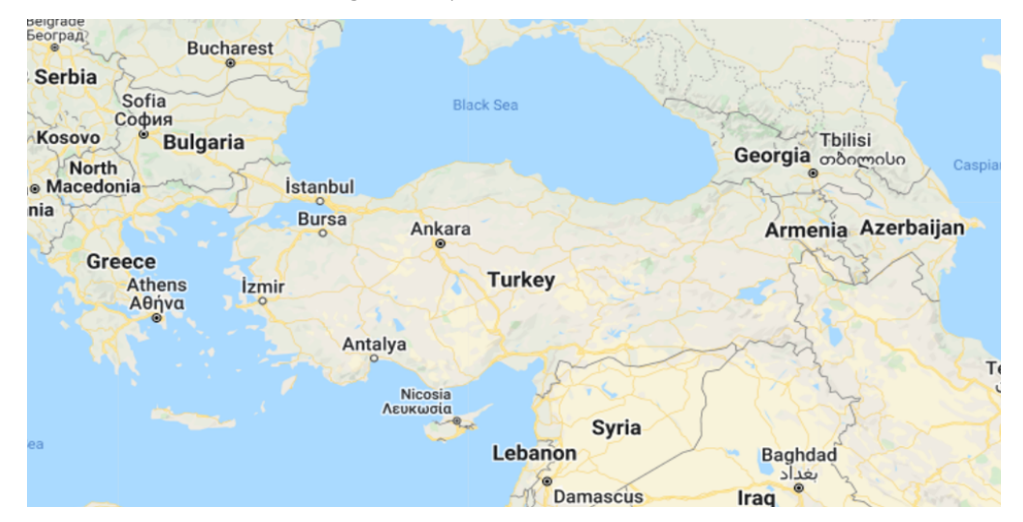
Fig. 2. The Four Key Cities of Türkiye (İstanbul, Ankara, İzmir, and Bursa) that are the subject of this research