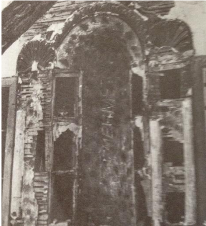
Figure 7. Flower bed of Zeki Kadirbeyoglu Mansion [8].

At first floor, there are pekes for living and recreation, closets and plaster flower bed.