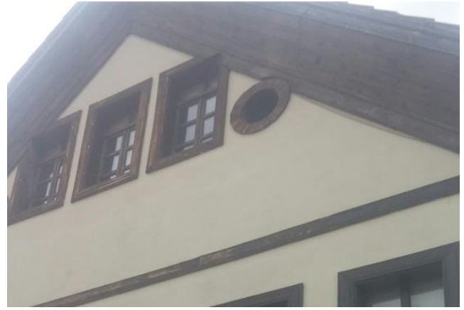
Figure 4. Wood windows and fringe of Balyemez Mansion [3].

Windows of Gumushane mansions are made in rectangular or arched form. Windows move narrowing from inside to outside to increase the amount of insolation and sun against continental climate. Generally, windows are made from wood, fences are from iron.