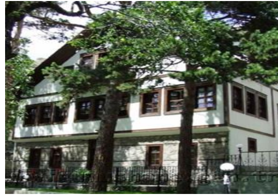
Figure 9. Hasan Fehmi Atac Mansion [11].

The mansion has three floors. The construction is done in two stages; first floor and penthouse are added later. The restoration of the mansion that provides restaurant and accommodation service was completed in 2005.