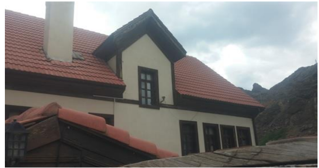
Figure 5. Roof and fringe of Balyemez Mansion [3].

External pitched roof, shoulder roof and saddle roof systems are seen in Gumushane house [6]. Mostly tops of the houses are covered with pitched roofs. Ceiling parts of the houses are coated with wood material, applied with wood sponce lath or beams. Sheet iron, silo and mostly tile are used to cover roofs.