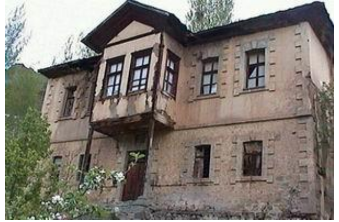
Figure 13. Rafet Çubukcu's House [12].

It is a Gumushane Mansion with an interior sofa and two floors. On ground floor stone is used, adobe material is used on upstairs and stone diversion border is used on side [11].