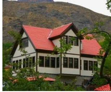
Figure 8. Adil Balyemez Mansion [10].

The construction whose restoration project completed in 2005, operates as restaurant and cafeteria.