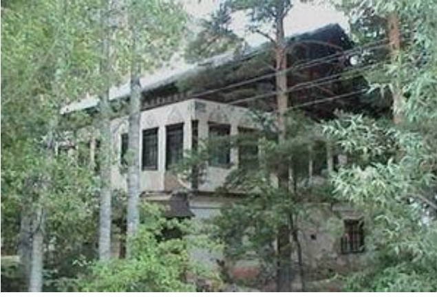
Figure 10. Sahbenderzade Mansion [5].

The structure is built with the content and construction style similar to Zeki Kadirbeyoglu's Mansion which was built in the almost same period.