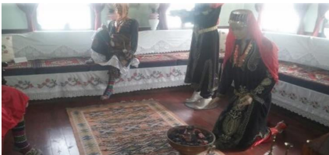
Figure 3. Bride room with Peke [3].

The room is the life unit that meet the basic needs like living, sitting, eating, relaxation, meal preparation. Gumushane mansions are done accordingly so as not to restrict multiple private life like kitchen, groom room, bride room, and mother in law room and guest room to meet the needs of patriarchal family like in the traditional Turkish way. One or two of the walls in rooms are covered with closets and cabinets. The parts without closets in front of windows are decorated with couches formed with cushions called "peke" in colloquial speech [6].