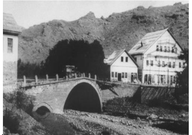
Figure 1. Gumushane mansions (1920) [3].

The stone has been used in South East Anatolia, stone with bonding timber in Eastern Anatolia, typical wooden skeleton in the Eastern Black Sea, stone and brick in Central Anatolia for residential architecture [2]. The main materials used in Gumushane are stone, adobe and wood.