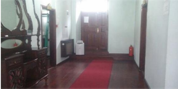
Figure 2. Hall [3].

While separating Turkish house according to plans, no-hall, exterior-hall, and inner hall and central hall plan type is used [4]. Major determinant of plan shape of Gumushane mansions is the hall like in traditional Turkish house architecture. Halls are located in the center of all rooms and room doors opens to the hall. Structures in Gumushane are designed according to inner hall plan type. Inner hall plan type is the most common type of traditional Turkish house. In this plan type, rooms are lined up to both sides of the hall, the hall stays as the center.