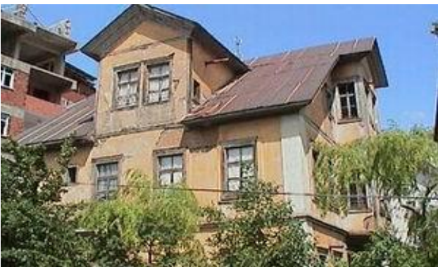
Figure 12. Erdemir Akagun's House [12].

The ground and top floors of the construction is built on different times. Similar penthouse and door knobs to Atac Mansion are seen.