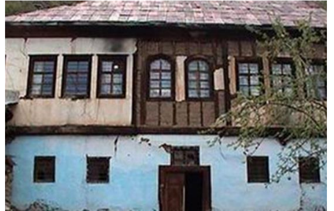
Figure 14. Ahmet Kaya's House [11].

The construction is built with 2 floors and four shoulder roof. Upstairs is entered from back side [8].