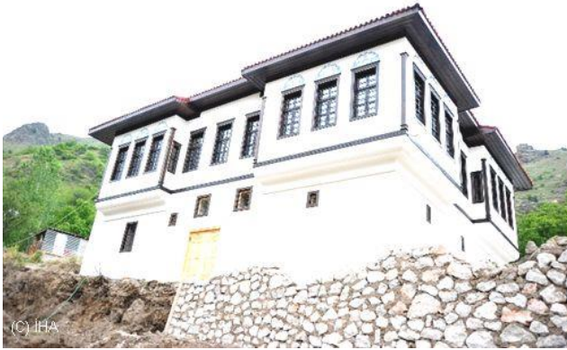
Figure 6. Zeki Kadirbeyoglu Mansion [7].

This mansion, a unique example for Gumushane historical mansions, is almost completed after being too ruined to be lived thanks to the restoration project.