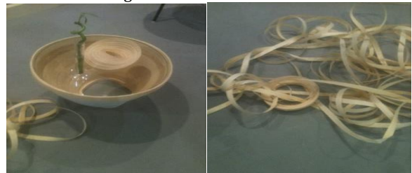
Figure 2: Furniture Samples made of tape wood Materials

There are many types of wooden materials used in the production of furniture designs and furniture products. Since wooden materials very expensive, the use of tapes in furniture production would be very economical. The tapes of the wooden timbers are cut in strips, and they are united in culvilinear forms. As an substitute to wooden materials these tapes are preferred in forming the surfaces of the furniture.