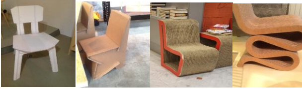
Figure 5: Furniture Samples made of Recycled Paper