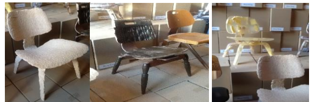
Figure 3: Furniture Samples made of composite wood and with old furniture pieces

Composite materials are made of the mixture of byproducts of the recycling woods, plastics and metals. The mixture of byproducts of these materials are stirred with resin. The composite materials can be easily given preferred shape to the furniture.