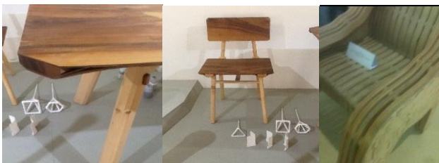
Figure 1: Furniture Samples made of wood and board

In production process of ecological materials bambu, palm tree, and wooden stocks are also preferred. However, these materials are subject to some surface improvements. Some other wooden materials such as oak, balsa and pine trees are also under consideration in producing ecological materials. Among them bambu is the one that can be easily put into production process. Ecological materials made of bambu are provided from Far East countries and China. These imported materials from the Eastern countries are very suitable to the garden furniture.