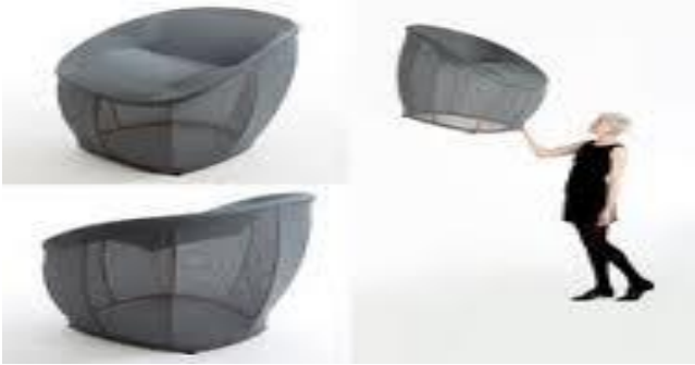
Figure 9 : Designed by Tomek Rygalik and Benjamin Hombuk for Moroso