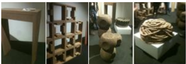
Figure 7: Furniture Samples made of cork

Corks as a furniture material is obtained from the cork trees, who's debarked during the summertime. Corks are one of the carbon dioxide emission sources of nature. Corks are also preferred in furniture design, because they can be given any shape and they are renewable. Corks are very light as compared to alternative materials. Beside these, it has resistance to the water. With its sponge like tissue and environment friendly characteristics, they are widely used in furniture design. During the production of furniture, all cutting and moulding techniques can be easily applied to corks. On the other hand, during the shaping process, corks can be utilized as a plastic material and it can be given plaque forms that could enable the furniture designers to combine with different materials. Beside these, it is the least costly material utilized in furniture production.