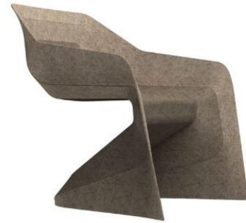
Figure 8: Furniture made of Hemps material [16]

The term of hems covers the cocanuttree peels and carrot fibres. These materials can be easily mixed with polymers to get an ecological material. Since hems absorb the environmental pollution, they are also used in industry. Hems also reduces the carbon dioxide emissions. In the beginning of 20th century, these ecological materials were used in making the panels of car doors. To produce hems, peels of coconuts and carrot fibres are soaked in water, and then they are separated from their peels. Since, their fibres are too long, they are mostly used in industry.