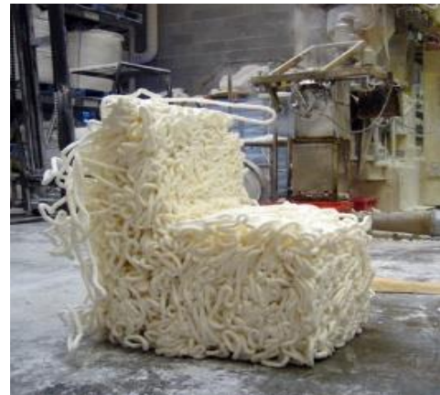
Figure 8: Furniture Samples made of starch (retrived from:Barbeo S., Cozzo B.,2012p:95)

Made with the foam extracted from patato starch, not only is the chair completely biogradable but also, in theory, edible. As it solidifies, the string of starch create a grid sculpture that can withstand considerable weight. Roling, overlapping and refolding the material creates an organic, linear form, producing furniture pieces that are at once eccentric and sully sustainable.