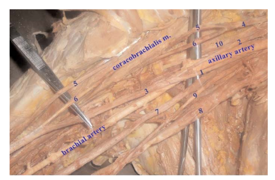
Figure 2. Right axilla and arm showing the coracobrachialis muscle pierced by two nerves, formation of the median nerve, and the union of an additional nerve to the median nerve distal to the muscle. 1: medial root of median nerve; 2: lateral root of median nerve; 3: median nerve; 4: common trunk for the musculocutaneous and unnamed nerves; 5: musculocutaneous nerve; 6: unnamed nerve; 7: ulnar nerve; 8: basilic vein; 9: medial cutaneous nerve of the arm; 10: posterior cord of the brachial plexus. [Color figure can be viewed in the online issue, which is available at www.anatomy.org.tr]

Analysing our case in for these classifications, however, we found no communication between the musculocutaneous and median nerves; this coincides with Type 1 of