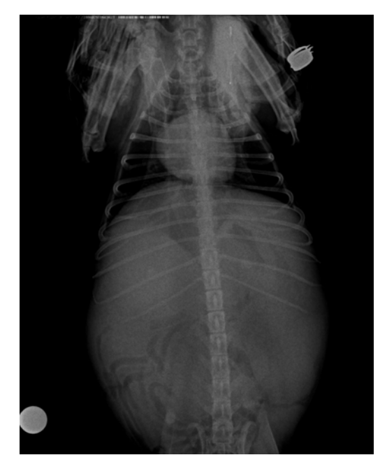
Figure 1. Radiographic view of case (V/D)

extended from the right quadrant towards the caudal was palpated. Direct radiography of the abdomen was taken and abdominal ultrasonography was performed. In the meantime, venous blood sample was taken and biochemical and hematological analyses were initiated (Tables 1 and 2). The liver was found to be enlarging (hepatomegaly) towards the caudal in the radiography taken in V/D position (Figure 1). In the ultrasonography (USG), it was determined that the liver had lost its homogenous appearance, its borders became irregular, there was a