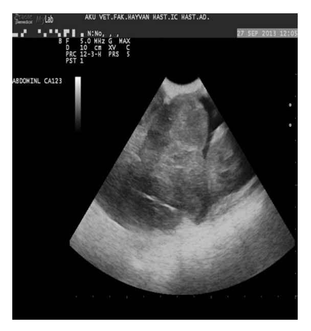
Figure 2. Ultrasonographic view of case

heterogeneous structure concordant with the massive appearance and there was free fluid in the liver. The hepatomegaly was confirmed with the USG findings, which supported the radiography (Figure 2). It was found in the biochemical measurements that the alkaline phosphatase (ALP) level increased whereas total protein (TP), albumin and glucose levels decreased (Table 1). Leukocytosis was detected in the hematological examination. The hematocrit (HCT) level together with mean corpuscular volume (MCV) and mean corpuscular hemoglobin (MCH) levels displayed a decrease (Table 2).