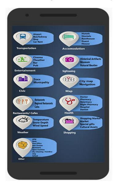
Figure 4: Sample general interface design for mobile city application of Erzurum city.

It is important to note that, this design should be adaptive according to the centers mentioned above since the needs are changing with respect locations people live or visit. In addition, the study should be repeated for similar cities to find suitable interface option.