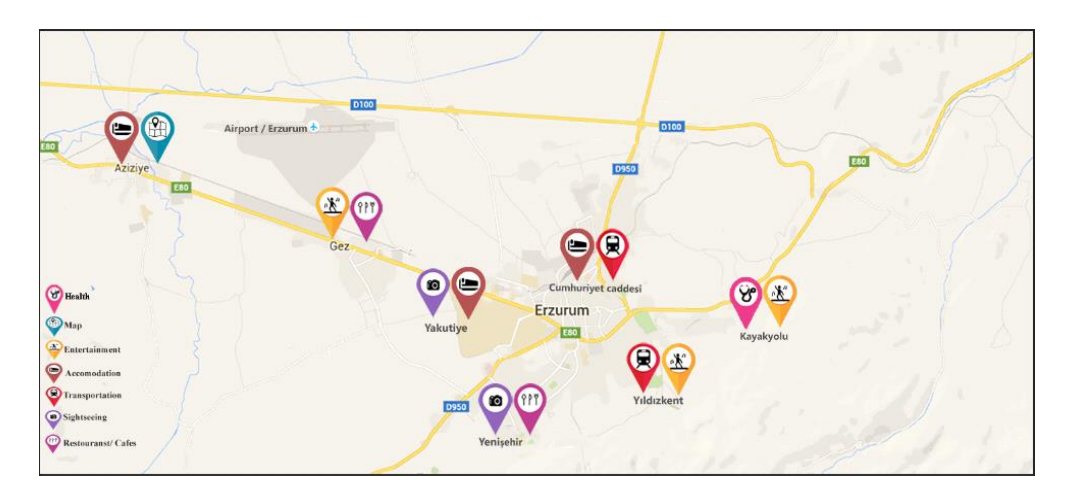
Figure 3. Mostly preferred two services according to locations.

As it is seen that people visiting Aziziye need to know information about accommodation and city map while those of visiting Gez want to know where the restaurants and entertainments are. The top two options for the participants from Cadde are accommodation and transportation. Similarly, civic and accommodation for Yakutiye, civic and restaurants for Yenişehir, transportation and entertainment for Yıldızkent and transportation and entertainment for Kayakyolu are the top two options according to the findings.