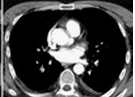
Figure 2: In thorax CT angiography, the partial thrombosis formations and left sided pleural effusion with the width of 11mm were detected again at his second application to the hospital in follow-up care.

second follow-up care . His follow- up under the LWH and immunosuppressive treatments has still been going on.