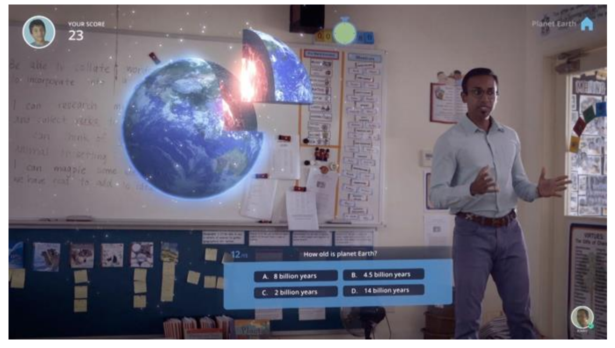
Figure 3. Augmented reality in education Source: (Cem, 2021)

the MR system reacts very quickly to the command to show the ventilation and cooling system of the jet engine and can instantly bring the desired design. There is no need to go to the hangar where that massive jet engine is located to receive this training. In addition, they do not divide those jet engines, which are very expensive, into parts for educational purposes and present them to the students' examinations. MR technology overcomes all these difficulties. Simulations such as all kinds of laboratory tests and examinations in the battlefields in history lessons will attract the students' attention, reduce the learning time and make learning easier (Özdemir and Öztürk, 2022).