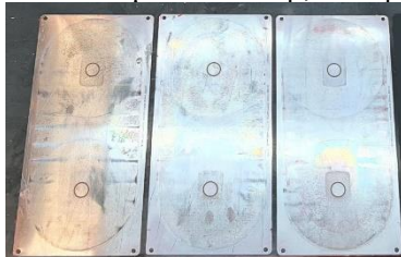
Fig.5. 28-30 \mu , 30-32 \mu , and 36-38 \mu . Cliché

In order to examine the effect of cliché engraving depth, 3 different cliché types were used. The difference between these clichés is the hollow depth measurements. Cliché engraving depth micron values are 3 pieces: 28-30 \mu , 30-32 \mu , and 36-38 \mu .