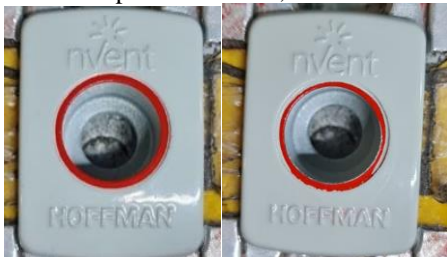
Fig.8. Proper printing Sample-improper printing sample

The increase in efficiency is inversely proportional to the number of repetitions. As the number of repetitions increases, the efficiency decreases, and as the number of repetitions decreases, the efficiency increases. If we compare the yields with the number of repetitions above;