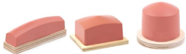
Fig.2. Fishbelly Silicone - Rectangular Geometry Silicone - Round Geometry Silicone [5]

II.1.3 Fishbelly Silicones: It is one of the varieties that show similar features to the rectangular geometry but form a narrower type of surface that needs to be pressed. There is a concavity in the middle area so that they can make the rounding movement on the product [7].