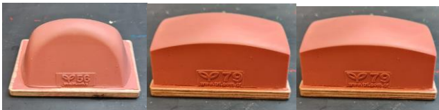
Fig.4. Fishbelly Silicone - Rectangular Silicone - Round Silicone

To examine the effect of silicon geometry, 3 different types of silicone were used. The photos of the silicone geometries are as follows.