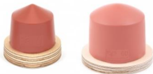
Fig.1. Pointed Silicone - Non-pointed Silicone [5]

One of the most important factors affecting pad printing is silicon geometry. Although they all seem like curved geometry, the angles given from the center to the tip change according to the shape of the printed product. For example, if silicone is to be selected for a piece with a pointed inward groove, it would be appropriate to choose a more right-angled silicone. (Fig.1) For products with softer curves and not a pointed inner cavity, silicone with a low apex angle should be chosen. (Fig.1).