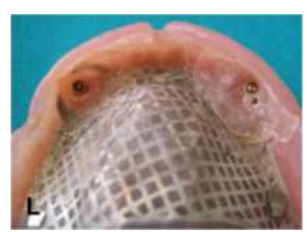
Figure 2. The overdenture type prosthesis supported by two dental implants