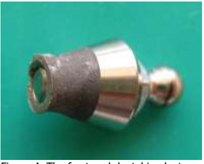
Figure 4. The fractured dental implant