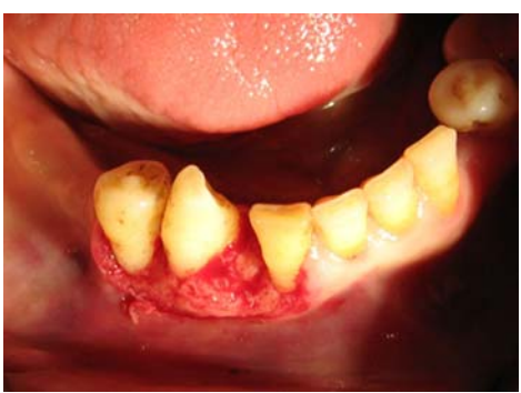
Figure 4. Surgical area after excision