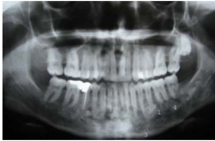
Figure 4. Panoramic radiograph taken at the postoperative 2nd year.