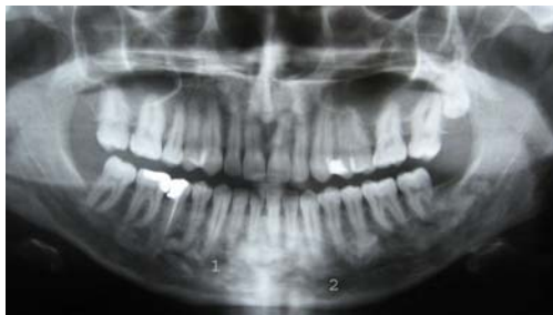
Figure 5. Panoramic radiograph showing changes in radiodensity at the postoperative 3rd year.