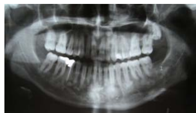
Figure 3. Panoramic radiograph taken at the postoperative 1st year showing increased radiopaque areas due to the maturation of the lesions.