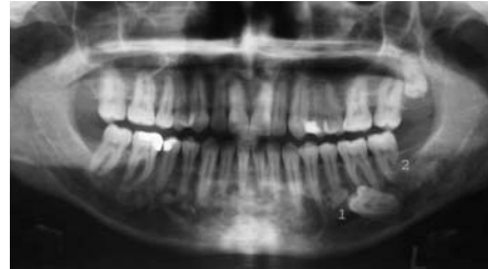
Figure 1. Panoramic radiograph taken at the 1st visit in 2004, showing irregular radioopaque-radiolucent lesions throughout the mandible.

anterior mandible was detected and recontouring was performed under local anesthesia a year later (Figure 3). The patient is under our follow-up as of 2004 (Figure 4,5,6).