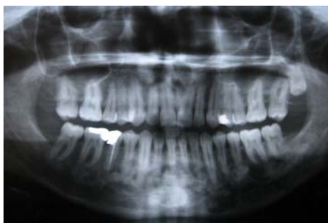
Figure 6. Panoramic radiograph taken 1 year after the last visit, demonstrating no changes compared with 2007