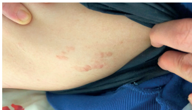
Figure 1: Plaques with raised skin, rough surface, and irregular edges, consistent with shagreen patch (Written consent was obtained from the legal guardian of the patient)

Our patient had 4 major symptoms including hypomelanotic macules, shagreen patches, angiofibroma, and cortical dysplasia, which are among the major diagnostic criteria,