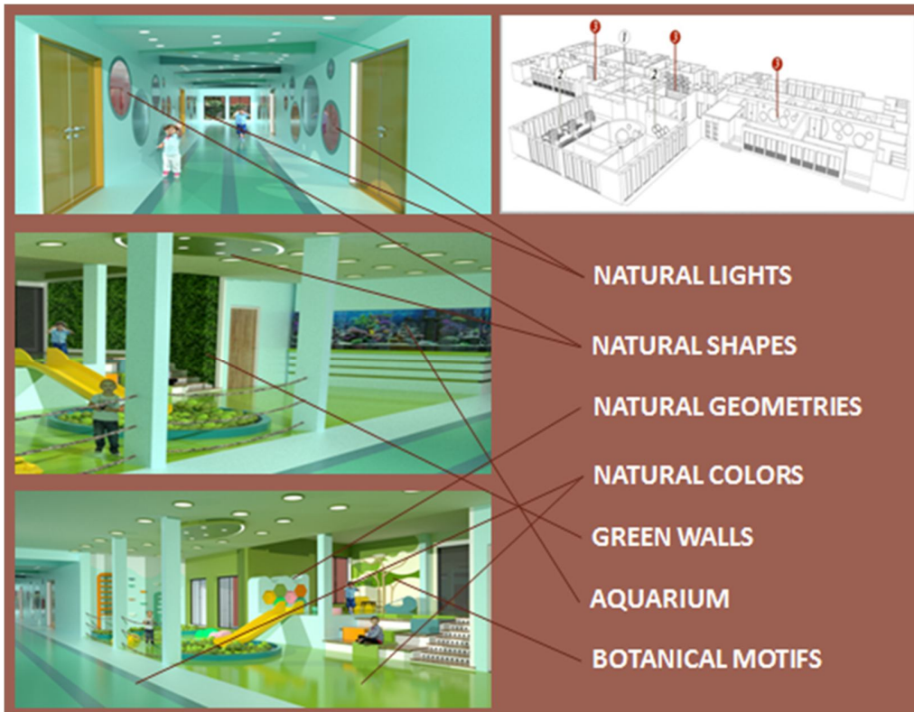
Figure 4. Biophilic design elements in the corridors and play area (Author, 2022).

the right wall of the stairs has been implemented so students will be exposed to living plants constantly independent of spatial conditions and not to limit the usable area. As stated by McCullough et al. [36], a green wall has the potential to inspire critical thinking by combining project-based learning strategies and environmental education. As another aspect that strengthens the interaction with nature is the animal [37], it was aimed to design an embedded aquarium in the wall for students to relax and create a focal point (Figure 4).