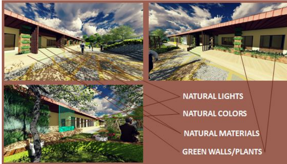
Figure 6. Biophilic design elements in transition spaces (Author, 2022).

and the entrance is therefore highlighted. Green walls and pot plants are situated in the semi-open spaces in front of the entrance and the administration spaces (Figure 6).