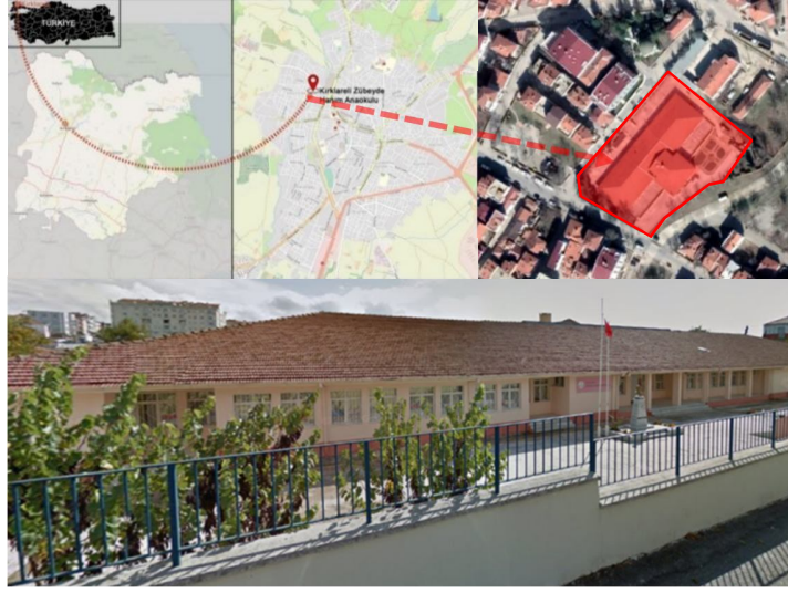
Figure 1. Location map of the study area and front view of Zübeyde Hanım Kindergarten.

Biophilia concept is the main and propelling component of the design idea initiated to enhance the closed and semi-open spaces of the Kırklareli Zübeyde Hanım Kindergarten by unifying them with the beneficial aspects of nature. In this frame;