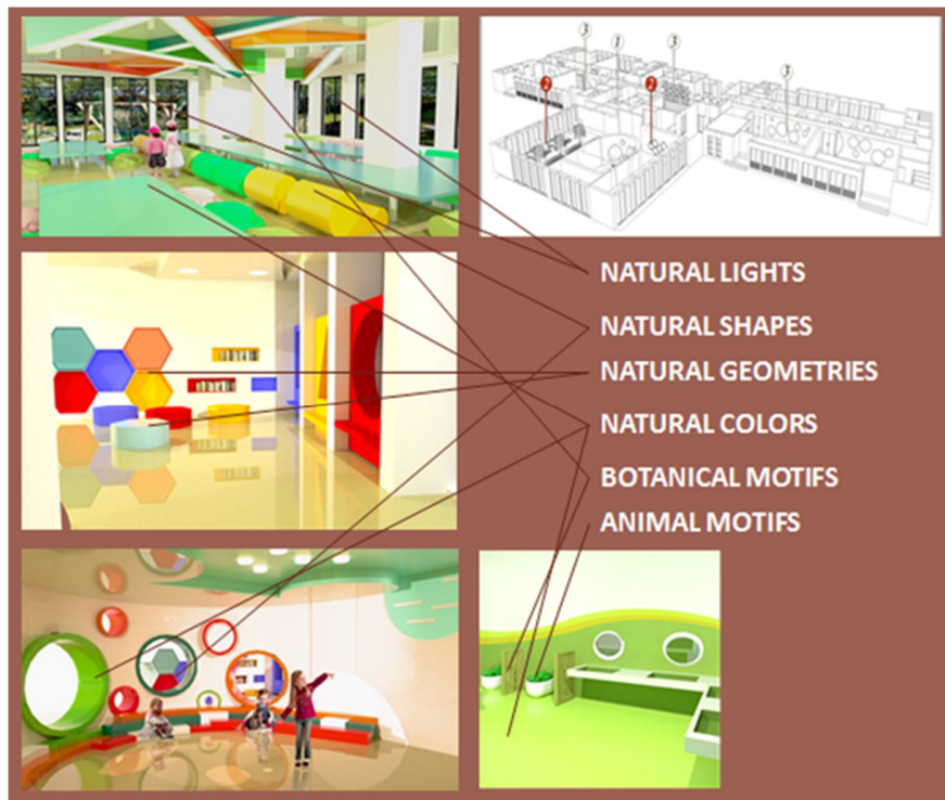
Figure 5. Biophilic design elements in the dining hall, multipurpose hall and restroom (Author, 2022).

In the activity and dining areas of the building, formations inspired from nature are repeated on wet surfaces. Honeycomb and circular shaped niches on the activity space, relief that refer to the tree branches on the canteen ceiling, and the cellular form of a leaf on the separation units in the restroom were used (Figure 5).