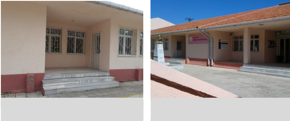
Figure 3. Semi-open transition spaces of Zübeyde Hanım Kindergarten (Author, 2022).