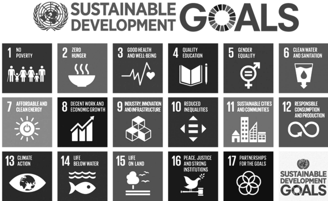
Figure 2. Sustainable Development Goals ( https://www.un.org/development/desa/disabilities/about-us/sustainable-development-goals-sdgs-and-disability.html Retrieved From: 15.11.2022)