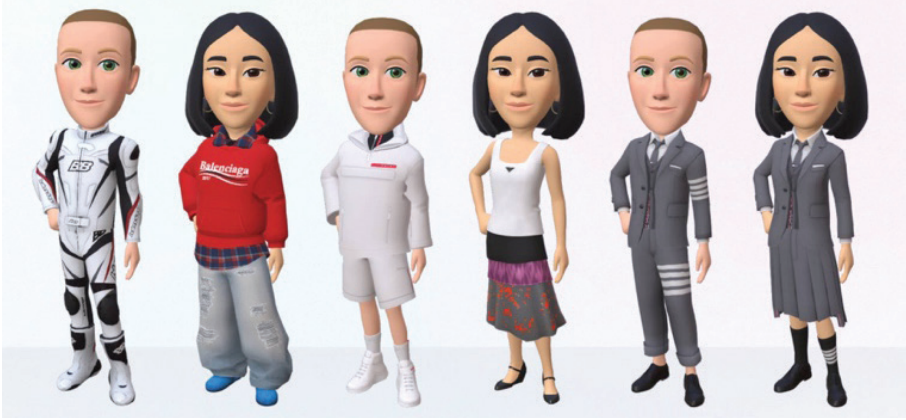
Figure 2. Avatars in Luxury Brand's Outfit