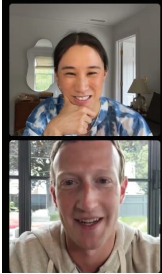
Figure 1. Instagram Live Source: https://www.instagram.com/tv/Ce6yFgbptyM/?igshid=YmMyMTA2M2Y%3D , (Date of Access: 02.09.2022).

In the announcement titled “Introducing the Meta Avatars Store” published on the official website of Meta Company on June 20, 2022, the following two statements are highlighted (Meta, 2022):