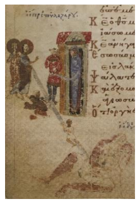
Figure 6 Hades holding sinful souls, Bristol Psalter, fol. 18r, 11th century, London Add. 40731 (Marinis, 2017, p. 64).

The images depicted in the paintings, especially Hades's Bosom swallowing the dead and devouring everything, are suitable for textual descriptions. In addition, Byzantine artists tried to portray Hades not only as a souls swallower but also as a place that holds souls tightly (Marinis, 2017, p. 63-64).