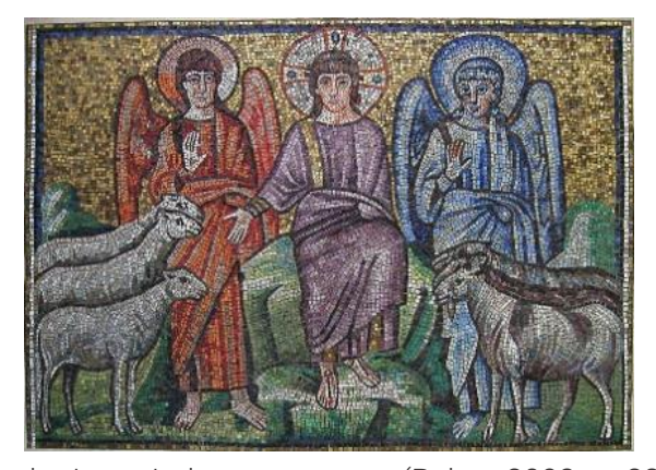
Figure 2 Separation of sheep and goats, 6th century, S. Apollinare in Nuova, Rome (Morgan, 2019, p. 6).

pointing to the sheep with his right hand (Figure 2).