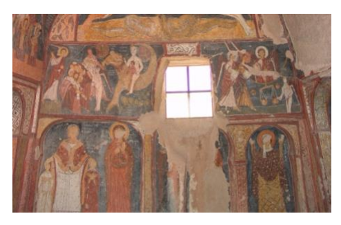
Figure 14: The Last Judgement, Gülşehir Karşı Church, Hell and Heaven, 1212, mural painting (Peker, 2008, Plate 27, 30).

The most crucial detail in this scene is the absence of the gate of Heaven in the background. In the painting, the leadership passes to the angel instead of St. Peter. The Torcello wall mosaic and the ivory artifact in London provide more detailed personified depictions of Hades. In the Torcello mosaic, Hades is painted blue on a throne and holds a figure in his bosom. His beard is given as white, emphasizing his age. Two angels are pushing sinners towards him. In the London ivory, similar to the Torcello wall mosaic, Hades holds a figure in his bosom and is depicted on a throne. In both pictures, the beast Hades sits on has disappeared, instead, there is a throne with heads coming out of it. As a matter of fact, in both portrayals, it appears that the described heads can be seen in the mouth of the beast sitting next to the throne.