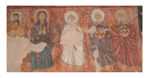
Figure 15: The Last Judgement, Gülşehir Karşı Church, Hell and Heaven, 1212, mural painting (Peker, 2008, Plate 27, 30).

The Heaven theme of the scene is located on the north wall and occupies the entire lower lane of the vault. In the southern part of the west wall, the theme of Hell appears as Punishment for Sinners, Sinners being taken to Hell by angels, Satan pulling the Clergy to Hell, and the False