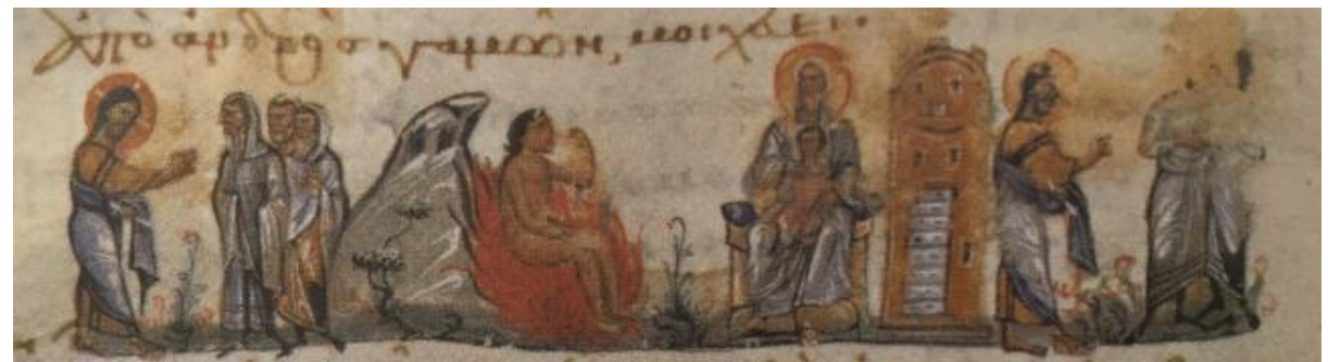
Figure 3 Lazarus in Abraham's bosom and rich man in Hades, Laurent Plut VI. 23, fol. 144r, 11th century (Marinis, 2017, p. 72).

displays a transitional image. Abraham is always inevitably clothed and surrounded by the souls of the redeemed (Marinis, 2017, p. 70-72).