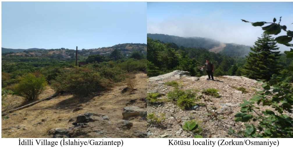
Figure 3. Photographs from observations in Gaziantep and Osmaniye parts of Amanos Mountains

The Amanos Mountains and its surroundings offer very important advantages to the region in terms of natural beauty. It is very important to support an area such as gastronomy that keeps people's travel demand alive for 12 months of the year with local delicacies. The field studies carried out within the scope of the research started periodically from the district of Nurdağı, and respectively, İslahiye, Akbez, Hassa, Aktepe, Kırıkhan, Antakya, Samandağ, Arsuz, Belen, Sarımazı, İskenderun, Payas, Dört Yol, Erzin, Osmaniye, Andırın, Düziçi, Bahçe and again Nurdağı. to be completed. The focus was on the skirts of the Amanos Mountains, but the situation of some highland settlements (Huzurlu, Çökek, Zorkun, Karıncalı and Cebel) was also observed from time to time (Figure 3-4).