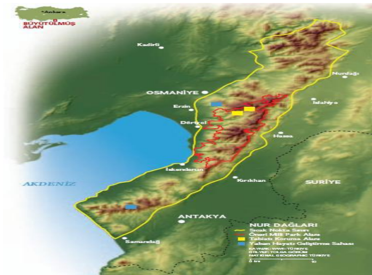
Figure 1. Amanos Mountain and Surround.

Amanos Mountains and its surroundings constitute the research material (Figures 1 and 2). The literature on the area and its natural potential also constitute the material of the research. The method of this study is the synthesis of the information obtained through literature review and field studies. Later, some suggestions were developed in line with this synthesis.