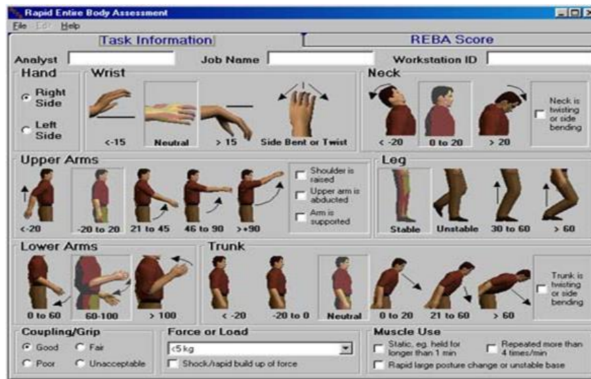
Figure 1. Ergo Intelligence software input field

After coding the REBA data and Questionnaire information, they were entered to SPSS software (version 20) and were analyzed by Mann-Whitney, Kruskal-Wallis, Spearman tests and Logistic Regression analyses. P < 0.05 was considered as statistically significant.