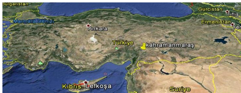
Figure 1. Location of Study Area on Satellite Image

Kahramanmaras whose great part occupies in northeast of the mediterranean region located in transition area which is between mediterranean climate and continental climate (Figure 1). But mediterranean climate is more dominant than the other in the city (Korkmaz, 2001). The study area reflects certain characteristics of Mediterranean climate with average annual precipitation of slightly over 700 mm, and precipitation is usually seen in winter and spring seasons in the region. The average annual temperatures is 16.7 °C, while maximum and minimum temperatures are 45.2 °C (July) and -9.6 °C (February), respectively (DMİ, 2010). Kahramanmaras has (C2 B'3 s2 b'3) sub-humid, mesothermal with third degree, large summer water deficiency and near maritime condition climate type according to Thornthwaite climate classification. In the study area, forest ecosystem, bare areas, shrubs areas, grasslands and agricultural systems (fallowing and plantation) exist dominantly.