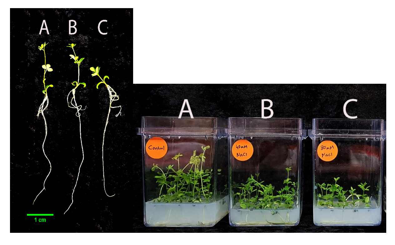
Figure 1. 14-days-old seedlings of Lotus corniculatus L. cultivar 'Leo' at different NaCl concentrations under in vitro conditions. A)0 mM NaCl-control- B) 40 mM NaCl C) 80 mM NaCl.

GRI = \Sigma No of Germinated Seeds/ \Sigma No of Days (Eq.5).