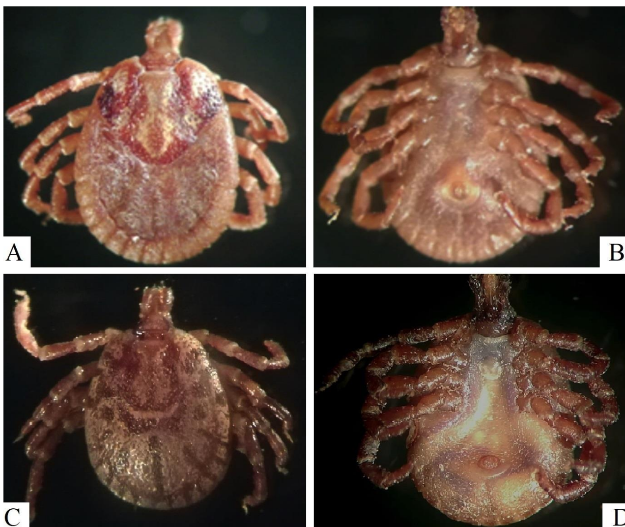
Figure 3. Amblyomma scutatum A. Dorsal view, female, B. Ventral view, female. C. Dorsal view, male, D. Ventral view, male.