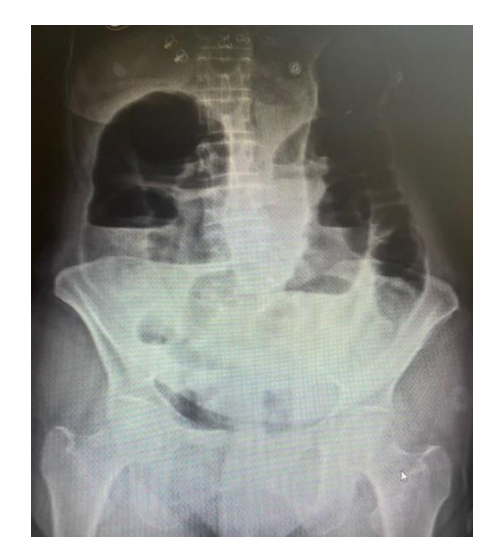
Figure 1. Abdominal X-ray (AXR) shows the diffuse gas appearance and air-fluid levels.

abdominal surgery was found other than PD. In her neurological examination, there was mild bradykinesia in her left upper extremity and small shuffling steps and a reduction in the arm swing on the left side during gait. Abdominal examination revealed diffuse tenderness and distension. There was no defense or rebound. Bowel sounds were reduced. Blood hemogram and biochemistry values were normal except for microcytic anemia (Hb: 10.7 (reference value:11,7-15,5 g/dL) MCV: 69 RDW: 17.4). There was the diffuse gas appearance and air-fluid levels on standing straight abdominal X-ray (AXR) (Fig.1). Oral intake of the patient was closed and intravenous fluid therapy was started and a nasogastric tube was inserted. A rectal tube was applied to provide decompression. In the abdominal computed tomography (CT), the rectum was normal, the distal sigmoid colon and other colonic and ileal loops were dilated (Fig.2). In the follow-up, the patient's abdominal distension increased and intestinal obstruction findings continued, was operated on with the suspicion of colonic pseudoobstruction by general surgery. A 1.5 cm mass in the sigmoid colon was resected in the diagnosis patient and а of colon adenocarcinoma was made as a result of the pathology.