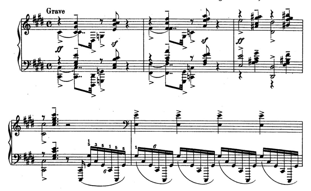
Figure 4. Study no.8, opening chords of the work and the wide arpeggios on the left hand, Study no.8 op.33 measures 1-5

Op. 33 Etude No. 8 is one of the most played etudes in this opus. The etude is a piece with a high sound intensity that includes violent fluctuations between minor and major, as well as harmonic dips and turns at the end, chromatic runs, big leaps in the left hand, and a bravura (effect for effect's sake) with opposing melodies. In line with all this information, a fairytale approach seems possible to make sense of the etude. A mythological heroic story can be an example of this approach. For example, let us imagine a fight between a mythological monster and a hero. The first, opening chords of the piece and the chords and arpeggios in different tonalities that follow represent the monster. From the moment this monster appears, it terrorizes and frightens everyone around it.