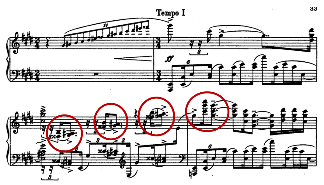
Figure 5. Study no.8, the middle part and dotted semiquavers, Study no.8 op.33 measures 17-20

be played so fast as not to be included in the number of measures. Especially the musical structures of the middle section, consisting of dotted 16<sup>th</sup> notes, shape this bravura structure, which, in turn, here, depicts the hero himself.