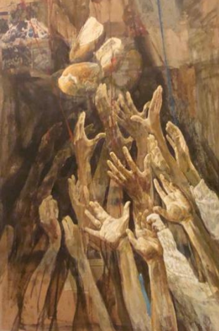
Example 5. The motif of bread in the work of Safet Zec before<sup>33</sup> and after the war.<sup>34</sup>

In the works of Zec, mysterious kitchen cloths and wrinkled covers with deep dark shadows, of light but a usually not completely white color, sometimes with a pattern woven into them, are mostly just a part of the still life on the table or draped on the back of a chair. In the early work of Zec, they are draped in almost ballet-like movements, allowing us to find the traces of the person who has left them there. Contrary to that, the clothes in Zec's post-war work are a witness of Zec's loneliness, longing, and anxiety (Example 6). In his work, they are sometimes even bloody and wrapped around a lifeless body, and are witnesses to difficult human fates. Within them, the aesthetic dramatically touches upon the existential, the artistic upon the ethical.