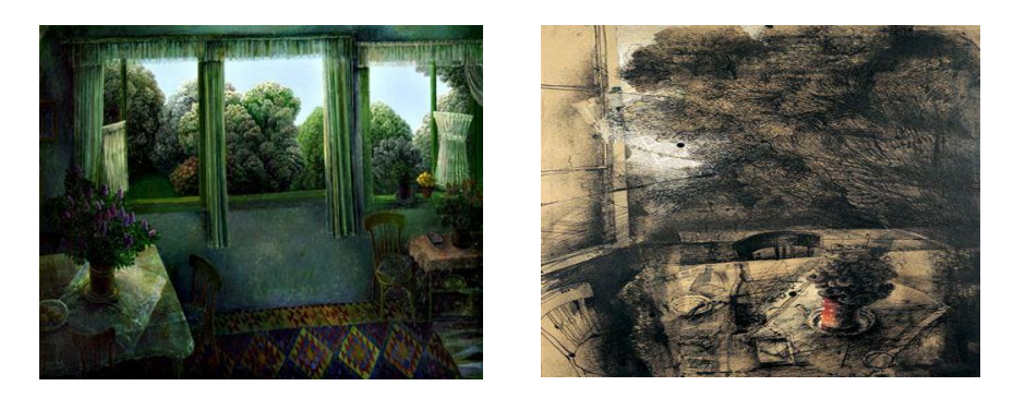
Example 4. The motif of the Bosnian room in the work of Safet Zec before<sup>29</sup> and after the war.<sup>30</sup>

rooms in Zec's works are "quite different",<sup>28</sup> with no windows, with deep, opaque shadows, quite threatening (Example 4).