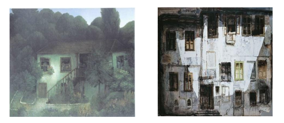
Example 1. The motif of the Bosnian house in the work of Safet Zec before<sup>18</sup> and after the war.<sup>19</sup>

lofty sky.<sup>16</sup> The houses are dominated by the color green which for Safet Zec is an "atmosphere of eternal summer, which is irreplaceable...".<sup>17</sup> However, in his works with a house motif, created between 1992 and 1996, the facades of the houses are damaged, derelict, irregular, and could be said to represent the factual state of affairs following the devastation of war throughout the country. The mortar on the facades is like a crust, which has been "scratched at", grey, and the overall atmosphere gives an impression of abandonment and decay (Example 1).