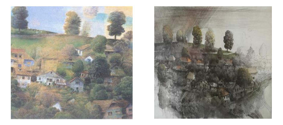
Example 2. The motif of the Bosnian mahala in the work of Safet Zec before<sup>21</sup> and after the war.<sup>22</sup>

war in Bosnia and Herzegovina, Safet Zec depicted the vivid arrangement of the houses on the slopes with their pronounced inclusion into a landscape that abounds in luscious green vegetation. However, these same, sometimes full of life, Bosnian mahalas in his post-war work became bleak. The atmosphere conveys the devastation of war, while the covered mezars or graves, on the top of the hill, symbolize and remind us of the human losses during the war (Example 2).