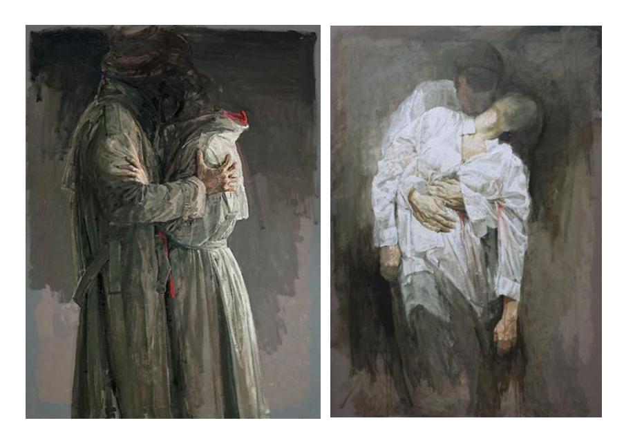
Example 7. The motif of the embrace in the works of Safet Zec before<sup>38</sup> and after the war.<sup>39</sup>

During this war, in addition to a great many casualties, displaced, and missing individuals on all sides (among the Bosnians, Serbs, and Croats who are the constituent peoples of Bosnia and Herzegovina), and the complete dissolution of a country, an event which the International Criminal Tribunal for the Former Yugoslavia and the International Court of Justice characterized as genocide, permanently marked the war and left a blemish on all of mankind. That event is the massacre in Srebrenica which took place in July 1995. At that time, military, police, and paramilitary formations of the Bosnian Serb forces carried out a series of mass liquidations of several thousand Bosniak men and boys. The precise number of those murdered is as yet unknown.