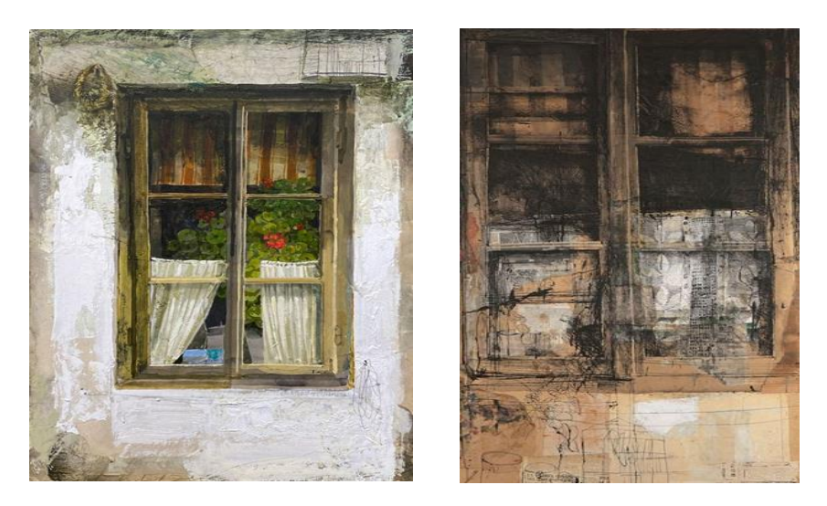
Example 3. The motif of the window of the Bosnian house in the works of Safet Zec before<sup>25</sup> and after the war.<sup>26</sup>

see the light and coloristic accents which revived earlier compositions. It is as if the artist wants to use them to depict pain, suffering and the heavy burden carried by post-war windows (Example 3).