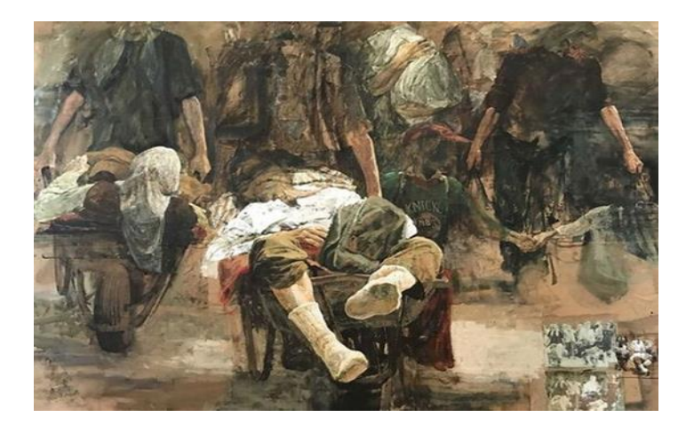
Example 10. The motif of the lifeless body in a wheelchair.<sup>49</sup>

homeland under difficult and dramatic circumstances, Safet Zec achieves the pinnacle of artistry in his work.