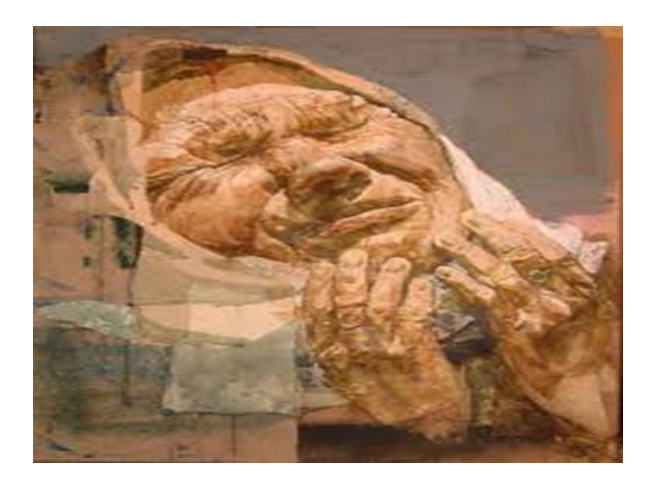
Example 8. The motif of the mother from Srebrenica<sup>43</sup>

of unendurable pain... whose souls were destroyed and systematically extinguished",<sup>40</sup> as well as of those who had lost their loved ones (Example 8). In an interview given to the daily paper Avaz, speaking about the works in this cycle, he stated: "Man, while he lives, is always trying to add something, to say something more about that tragedy, to leave a trace. It is a rather extensive group of works and it is always present in part in all of my exhibitions. Naturally, I am always looking for an opportunity to integrally present these works. The understanding that people know very little about it, that they are not very informed either historically or humanly about the dimensions of that tragedy, makes it over and over again my duty to contribute to the truth of what happened so that it may never happen again."<sup>41</sup> In the same interview he points out that "he will never stop speaking out about the injustice that befell innocent mothers, fathers, daughters, and sons, since it is his duty as a human and an artist."<sup>42</sup>