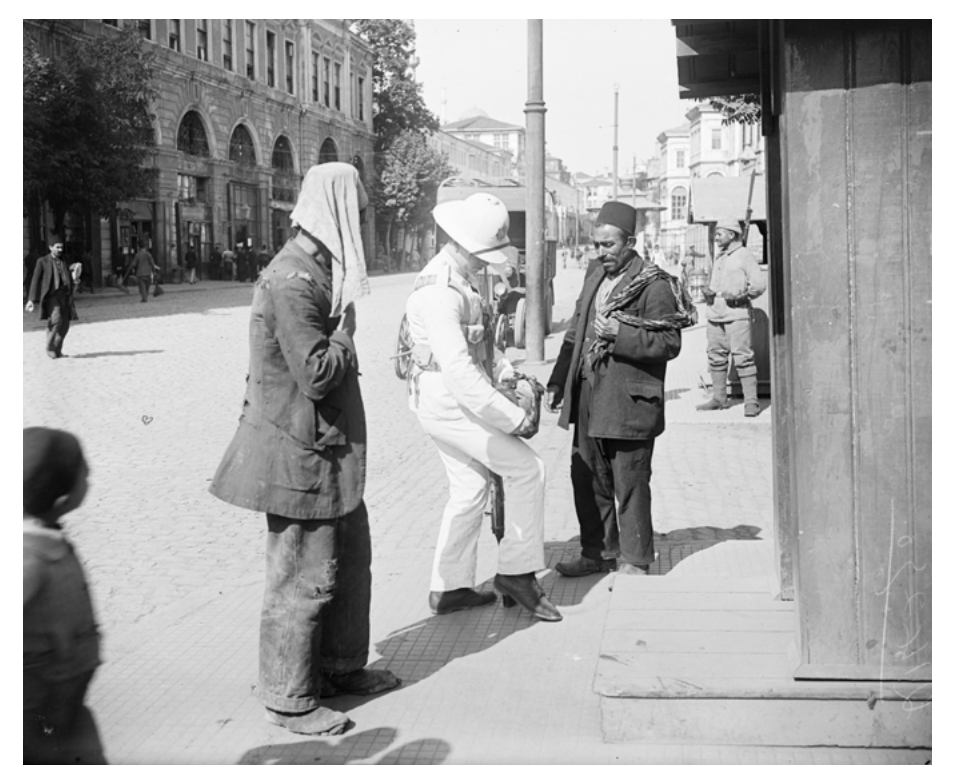
Figure 2: A British Marine sentry at the entrance of the Arsenal at Istanbul, examining a Turk's bag. Note Turkish sentry at far side of the gate. Photograph: W. J. Brunell, 1919. Imperial War Museum, Q 14270.

Additionally, the inter-Allied police participated in the judicial system set up by the occupation authorities to reinstitute the capitular regime that the Ottoman government had abolished in 1914.<sup>8</sup> Thus, "it was thanks to the inter-Allied police that the Allied consulates were able, for three years, to investigate and settle a large number of disputes of a criminal, commercial, rental or other nature arising between their nationals and Ottoman subjects."<sup>9</sup> As recognized by the British High Commissioner, the legal ambiguities of the inter-Allied occupation were such that "the heads of the inter-Allied police [had] found themselves forced into the position of being a kind of court of summary jurisdiction, and to give decisions which only by the most elastic interpretation [could] be brought under the denomination of military necessity."<sup>10</sup>