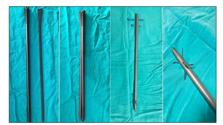
Figure 2. Images of the BEIMN and the adjustable TDIMN length and diameter measurements drawing

In the first group, the LIMNs applied within the canal at 1mm smaller diameter than the diameter of the last reamer, were determined to be fixed with interlocking screws in the proximal (n:2) and distal (n:2). In the second group, the BEIMN diameter was determined to be selected as 1mm smaller than the diameter of the last reamer. The nail was adjusted to be facing the anterolateral of the femur that would provide compression of the blade groove. The length of the nails was selected to be of an appropriate length equivalent to the metaphysiodiaphyseal junction of the proximal and distal areas, which would provide expansion with the blade, and after the application, that the blade ends were in contact with the bone endosteum was determined with fluoroscopy. In the third group, the TDIMN diameter was determined to be 1mm smaller than the diameter of the last reamer. The adjustable distal hooks were attached to the bone inner cortex and by applying maximum torque, the hook opening was confirmed under fluoroscopy (Figure 2). To provide stronger fixation, the hooks were placed in the distal diaphyseal region without passing to the metaphyseal region. Fixation was provided with 2 locking screws in the proximal and 6 adjustable/retractable hooks of 38 mm diameter in the distal.