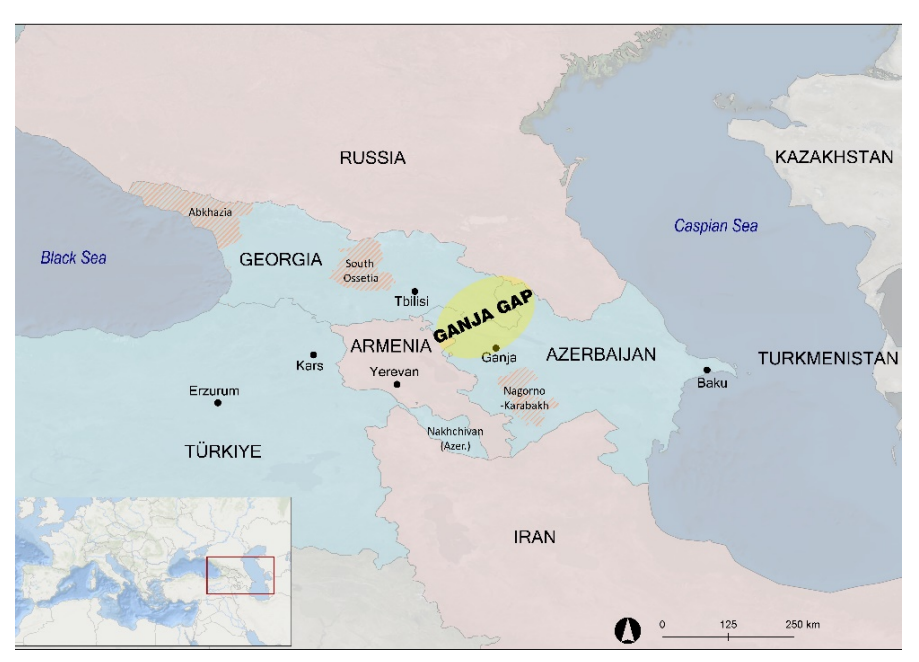
Figure 2 : Map of Ganja Gap (The Geographic Information System of the Commission-GISCO activities-EUROSTAT EU, made with ArcGis 10.8.2.) (Authors' elaboration).

The Ganja Gap is the narrow border space between Georgia and Azerbaijan, roughly 60 km wide, which allows land transit between Asia and Europe bypassing Russia and Iran (Figure 2). It takes its name after the city of Ganja, the second largest city in Azerbaijan, and close to this space and north of Nagorno Karabakh. Ganja Gap breaks the continuity of the axis Russia – Armenia – Iran and allows the transit between Georgia and Azerbaijan, further expanding to Türkiye, the Black Sea and Europe to the West, and to Central Asia and the verge to China to the East.