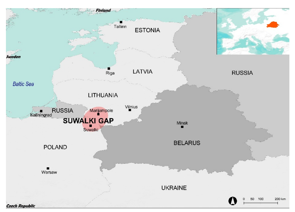
Figure 1 : Map of Suwalki Gap (The Geographic Information System of the Commission-GISCO activities-EUROSTAT EU, made with ArcGis 10.8.2.) (Authors' elaboration).

This article intends to shed light on a gap that is often unnoticed but of great importance for the stability of the Caucasus region and the economy and development not only of the region itself but with wider consequences for Europe. First, a review of the foreign policy of each regional actor is done, highlighting their interests and concerns. The article focuses then on the importance of the Ganja Gap and its implications for wider security. Lastly, some reflections are provided due to the new security scenario after 2022. Our hypothesis is that the escalation of the confrontation between Russia and the West may affect the stability of the Caucasus region, where the Ganja Gap plays a vital role, both in international security preventing conflict and in terms of economic development.