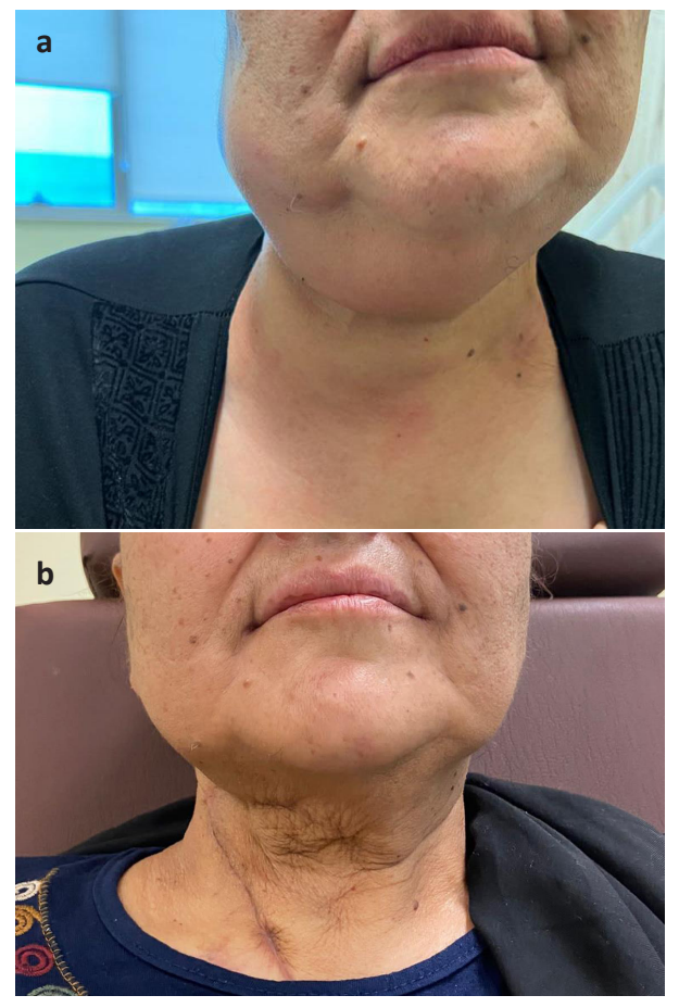
Figure 1: a) Swelling due to deep neck infection from the right side of the patient's face and neck to the bottom of the clavicle and b) Image of the healed patient.

the localization of the carotid sheath, the sheath was opened from the skull base to the level of the clavicle. The inside of the sheath was also found to be filled with intense purulent secretion (Figure 3a). Following this, the clavicular region was explored and the necrotic tissues were cleaned. The layers were closed appropriately and the patient was transferred to thoracic surgery in the same session. After double lumen intubation, the thoracoscopic entrance was performed through video-assisted thoracic surgery (VATS). The exploration showed infiltration of abscess content from the mediastinum into the thorax. About 600 cc of empyema content was aspirated. It was revealed that the mediastinal surface was necrotized starting from the level of the azygos to the level of the apex. Upon opening the mediastinum with the help of a harmonic scalpel, it was observed that the inflammation came from the edges of the esophagus, trachea, and vena cava superior (VCS). The inflammatory content was aspirated and necrotic tissues were also debrided (Figure 3b). After intrapleural lavage, a thoracic tube was inserted, the expansion of the lung was observed, and the layers were duly closed.