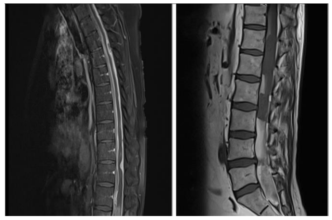
Figure 2. MRI THORACIC-LUMBAR: Multiple intra-dural metastatic mass lesions are observed in the thoracic and lumbar regions, which compress the spinal cord. In addition, there are diffuse linear enhancement and millimetric nodular metastases along the spinal cord.