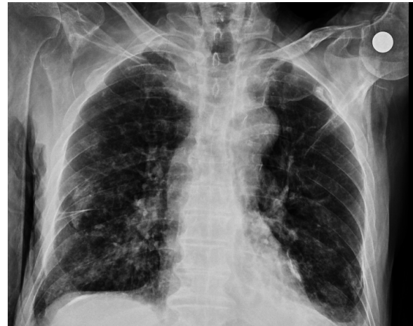
Figure 1: Posteroanterior (PA) thorax radiogram ; There was no foreign body during the first hospitalization.