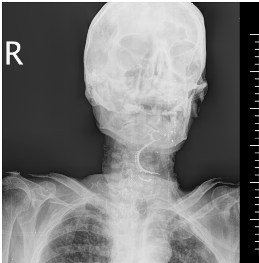
Figure 4: PA neck radiogram ; Foreign body detection after the onset of symptoms and ENT consultation.