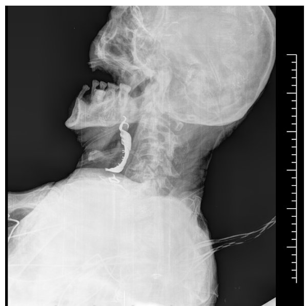
Figure 3: Lateral neck radiogram.