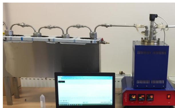
Figure 1. Pyrolysis experimental set up.

The pyrolysis experiments were conducted in mechanical engineering department laboratory, Bitlis Eren University. The experimental set up is shown in Figure 1. It is fixed bed reactor. Reactor was made of stainless steel and has the diameter of 10 cm and the height of 20 cm. Further information can be found in this study [15].