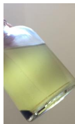
Figure 4. The mixture of diesel and pyrolysis oil.

result. It can be concluded that pyrolysis oil has different chemical structure than fossil fuels. In one study, waste engine oil that has 870 kg/m 3 density was able to mix with diesel fuel since waste oil has a close density with diesel and has similar chemical properties. The waste oil was successfully utilized in a diesel generator [24].