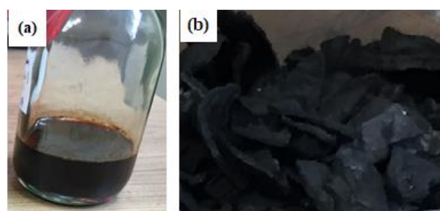
Figure 2. The products of pyrolysis reaction: pyrolysis oil (a), solid product (b).

The main products of pyrolysis reaction are pyrolysis oil, non-condensable gases, and solid products. Figure 2 shows pyrolysis oil and solid product that are produced from walnut shells at 500 °C. The oil has a strong smell that is similar to vinegar. Solid product is black and alike a char coal. Same products are obtained at different temperatures ranging from 400 °C to 600 °C.