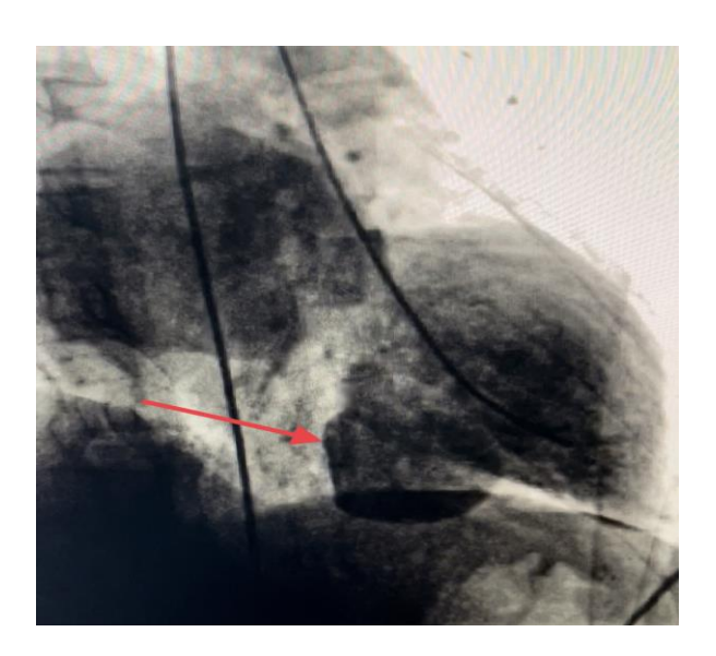
Figure 1: Ventricular aneurysm seen in angiography.

In this paper, we describe the case of a 53-year-old diabetic man who was admitted to our cardiology department for severe mitral valve regurgitation. He had undergone percutaneous coronary angioplasty with stenting of the mid segments of the left anterior descending artery (LAD) for myocardial infarction one year prior. On the ECG, there were abnormal Q waves in the inferolateral leads and sinus rhythm at 90 beats per minute. A sacular aneurysm of the infero-lateral left ventricular wall, significant mitral valve regurgitation, and fibrosis were all seen on and transthoracic transesophageal echocardiography, but no thrombus reported. A mildly decreased ejection fraction (EF) of 50% was seen along with LV hypertrophy and dilation. The ultrasound results and observable diffuse coronary stenosis at the ending point of the LAD stent application were verified by coronary angiography (figure1). Other coronary arteries did not show any noticeable stenosis. The decision to do surgery was made. Gaint aneurysm was seen in posteriolateral wall (figure 2). The patient had mechanical mitral valve replacement, coronary artery bypass grafting of the left anterior descending (LAD) with the left internal mammary artery (LIMA), and ventricular aneurysm repair (figure 3). In the early stages of his recovery in the intensive care unit after the surgery,