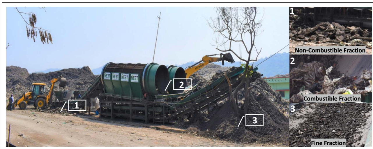
Figure 2. Onsite screening and segregation of the excavated waste.