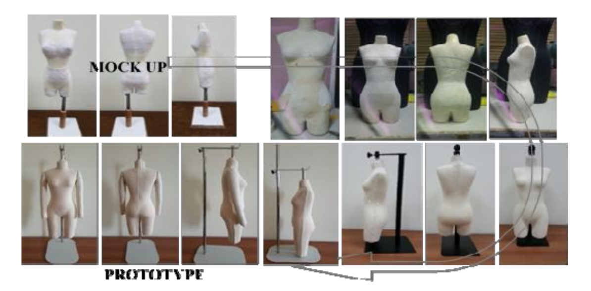
Figure 2. From mock-up to prototype process of the reformed traditional female dress form

from ready to wear company in Ankara. Cegindir used this form at her undergraduate and graduate program courses, and Cegindir and Oz also worked on this dress form creating pattern cutting implementations by draping method successfully (35). During the assessment process, they considered on ideal proportions of female figure. Then cost analysis was done by company. All kind of material costs were minimized. Finally, it was decided that its retailing price and the prototype dress form was sent to mass production. Scholar and her undergraduate students started it using for patternmaking experiences, so do many other fashion design college scholars and their students in Turkey.