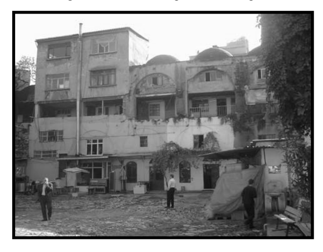
Figure 5. Mezzanine floors in Balkapanı Inn (17th yy) [3]

The random construction of mezzanine floors, the building of dividing walls, the opening of display spaces in facades facing the street and the construction of new entrances have resulted in rapid changes in the inns. A mezzanine floor, added to the second-story colonnade at an inn to increase the space, was built all the way up to the steel tie rod which was then used to support its weight. It has been noted that entire walls have been removed so that large machines could be brought into inns that are used as workshops and it is thought that the vibrations created by those machines have further strained the structure of the buildings themselves. Such uses of inns have been detrimental to their original structure and led to structural damage such as cracks, separation, collapses and crumbling.