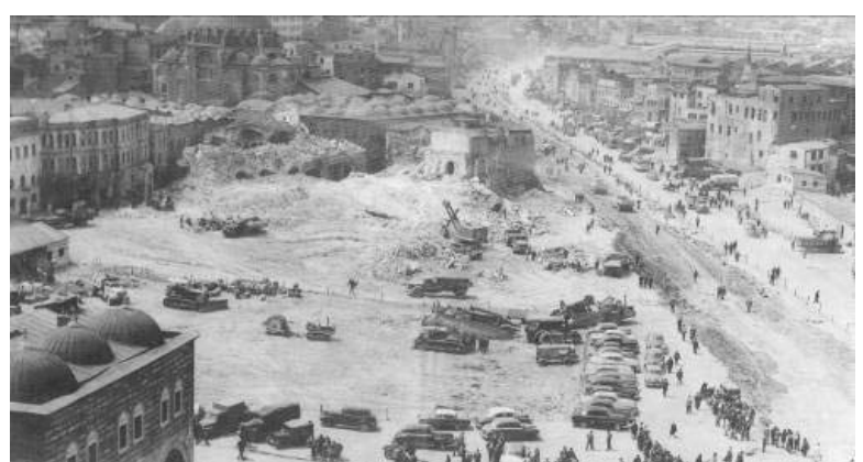
Figure 3. Eminonu Square in 1945 (https://www.google.com.tr/search?q=eminonü+1945&tbm)

The unplanned development of cities and the construction of excessively tall buildings made possible by the granting of building rights within the framework of new urban plans has had a detrimental effect on historical buildings and resulted in their disappearance from the urban fabric. The construction of tall buildings around the inns of Istanbul led to their elimination from the city's skyline, and the increase in the density of buildings has led to the widening of the narrow streets where the inns are located. Furthermore, increases in sound pollution and the introduction of undesirable foreign elements have had a negative impact on the visual unity of the historical surroundings and the harmonious effect of the setting.