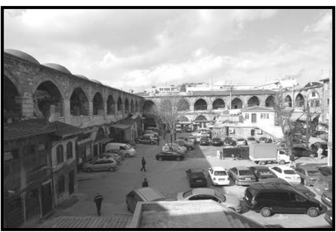
Figure 7. Cars in the courtyard of Vezir Inn (17th yy) [3]

Due to the fact that there aren't any parking lots in the district, the courtyards of the majority of inns are used as parking areas and delivery trucks bringing and picking up goods enter the courtyards as well. The tremors created by such vehicles as they come and go has a negative impact on the buildings of the inns. In addition, the streets in the district aren't broad enough for the large amount of vehicular and foot traffic, leading to yet another negative situation, along with the problems created by the loading, unloading and storage of goods. Because the district is not residential, at night it is rather empty, thus leading to problems of security; additionally, the grounds in the area aren't looked after and are unkempt (Figure 7).