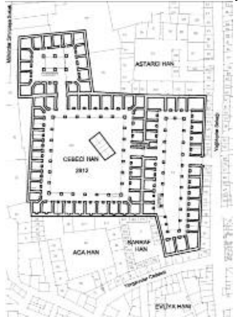
Figure 2. Cebeci Inn (17th yy), ground floor plan [2]

significant number of these inns are used for both the production and sale of traditional commercial items such as handmade toys, dyed fabrics, inlaid mother of pearl, calligraphy, marbled paper, hand-woven goods, embroidery, baskets, wooden boxes, hookahs and pipes. In the 18<sup>th</sup> century, there was no longer room in the Inn District for the construction of inns with large courtyards so fewer of them were built. During and after the 19<sup>th</sup> century, inns were built on smaller plots of land but were taller due to the introduction of new building technologies that employed concrete and steel. In that century, we begin to see inns that are four and five stories tall, but their inner courtyards are no longer open to the sky as they were transformed into enclosed areas accessed by stairs.