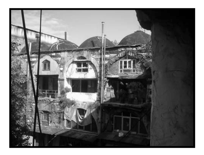
Figure 6. Additional rooms in the porticos of Balkapanı Inn (17th yy) [3]