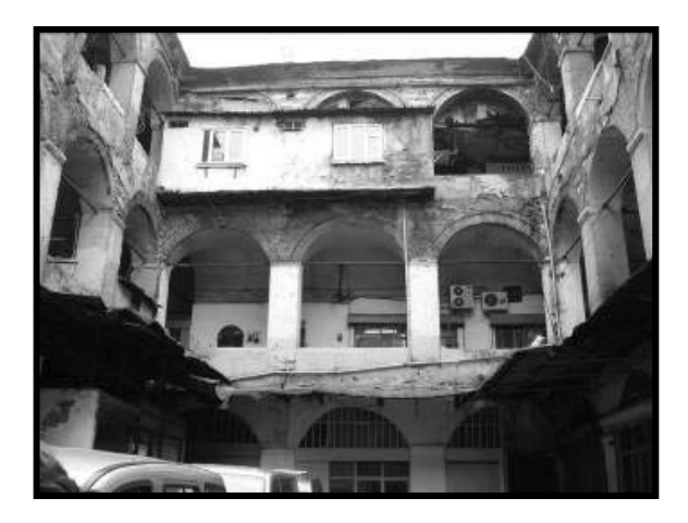
Figure 4. Additional rooms in Buyuk Yeni Inn (17<sup>th</sup> yy) [2]

Such additions were initially made with materials that could easily be removed, but those were later reinforced with more permanent materials such as fired bricks and brick blocks. Over time, new additions have been made on top of those as well. Such additions occupy the central courtyard area, blocking off the structure of the building. It has been found that the owners of the properties, seeking to enlarge their space, have detracted from the architecture of the inns by adding mezzanines on the upper floors of inns, as well as building mezzanine floors in colonnades, knocking down walls to join rooms, blocking off colonnades and building additional rooms in corridors, and building rooms against the facades of the courtyard walls which have in some cases been plastered over and painted (figure 4). The creation of additional rooms by blocking off colonnades and the creation of corridors between them makes it difficult to recognize the colonnades for what they are.